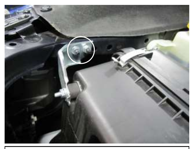
c. Remove the two bolts on the fender that secure the bracket. These will be re-used.