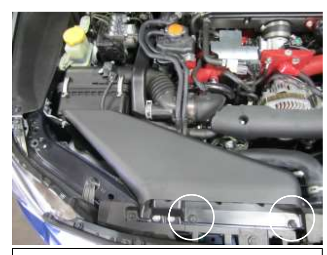
a. Remove the two plastic clips and the factory fresh air inlet duct.