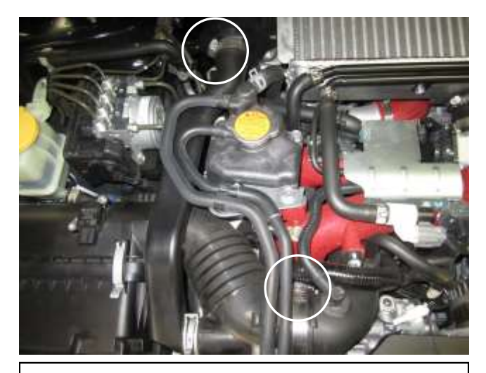
e. Loosen the hose clamps at the sound tube and the stock intake tube. Then remove the complete air box from the vehicle. NOTE: Do not discard your stock equipment.