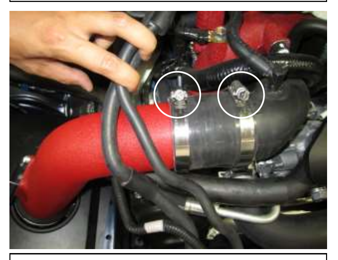
k. Install the supplied coupler (5-275) and tighten the two hose clamps (9444) onto the AEM intake tube and compressor inlet tube.