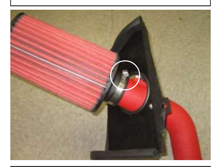
g. Install the AEM filter onto the AEM intake tube through the heat shield and tighten the hose clamp (9448)