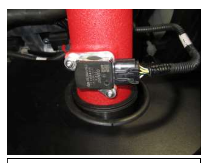
n. Plug in the mass air flow sensor connector that was detached in 2b.