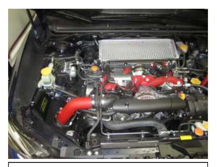
AEM Intake Installed.