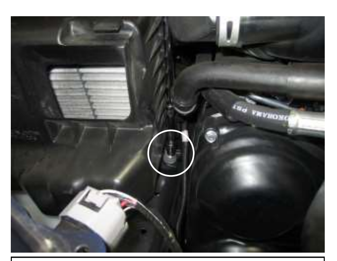
d. Remove the bolt that secures the air box to the engine bay.