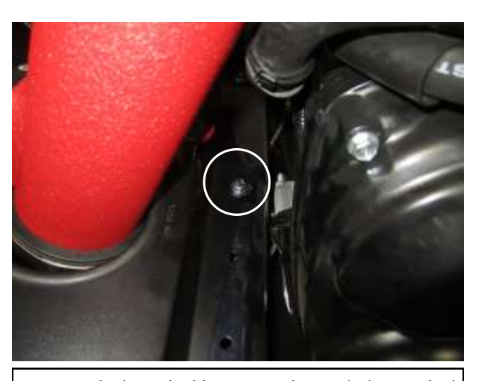
j. Secure the heat shield to engine bay with the supplied bolt (1-2038) .