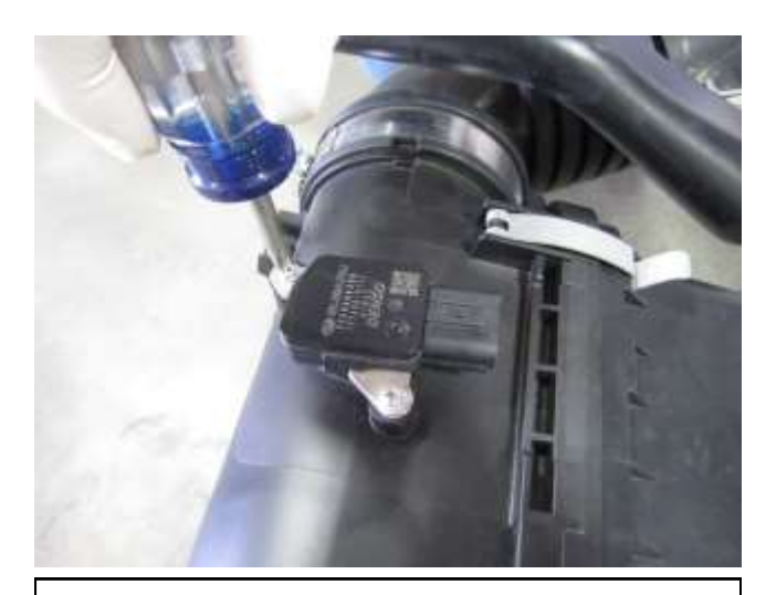
f. Remove the mass air flow sensor from the stock air box. This will be reused in 3a.