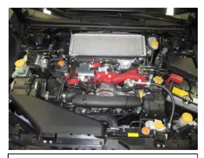
Stock Intake Installed.