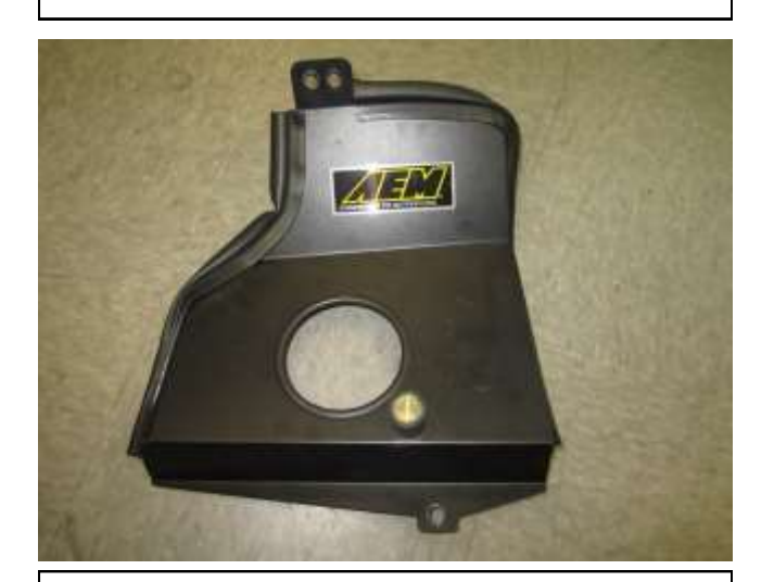
f. Completed heat shield assembly.