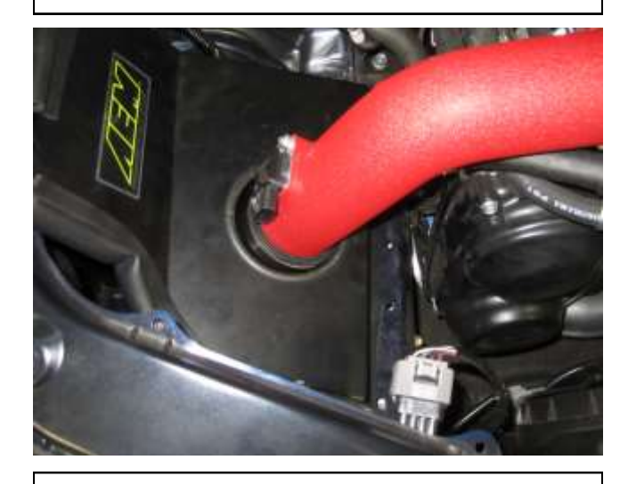
h. Install the filter, heat shield, and tube assembly into the vehicle.