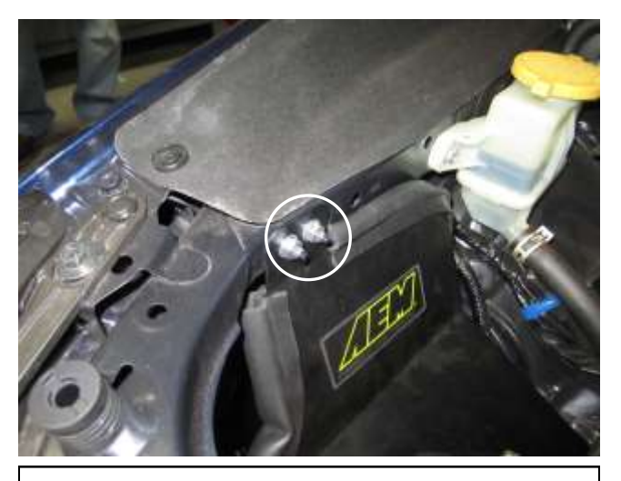
i. Re-install the nuts that were removed 2c) and tighten.