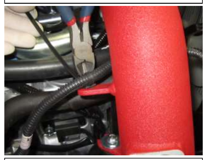
m. Secure the mass air flow sensor loom to the AEM intake tube with supplied push-in zip tie.