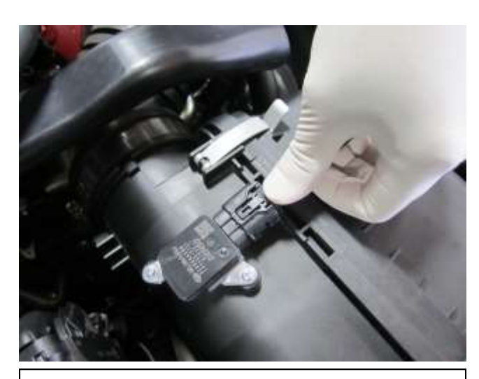
b. Depress the tab on the mass air flow sensor plug and disconnect it from the sensor.