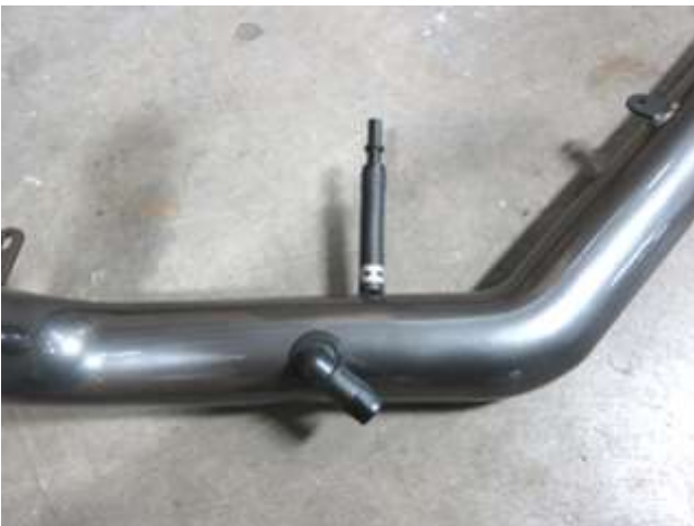
c. Install the 90° connector into the grommet, then install the provided hose/vent/spring clamp onto the AEM intake tube.