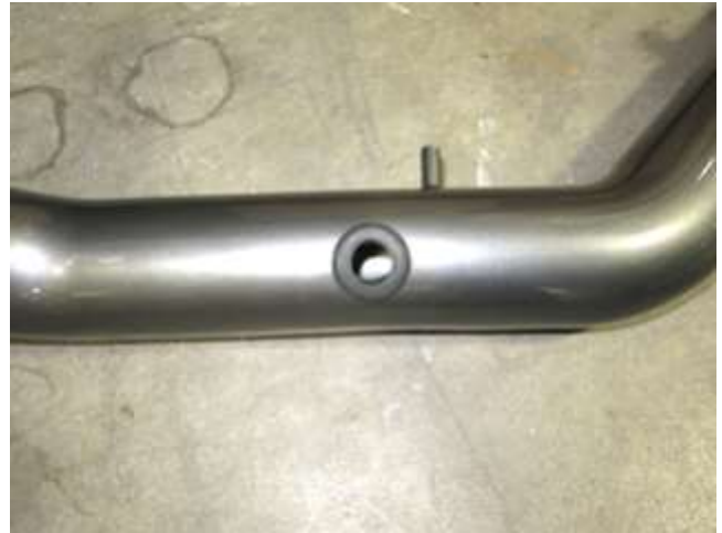
b. Install the grommet (784645) into the AEM intake tube.