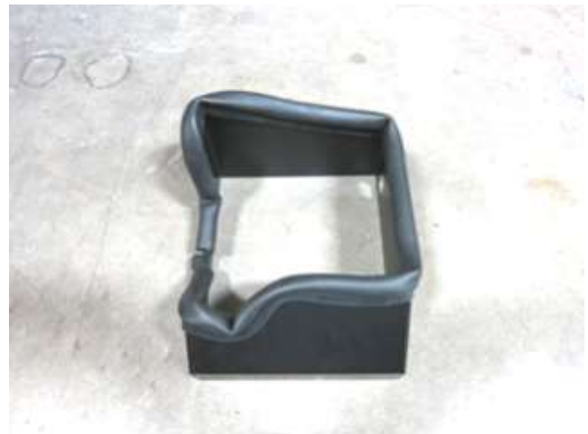
d. Install the provided edge trim onto the heat shield as shown.