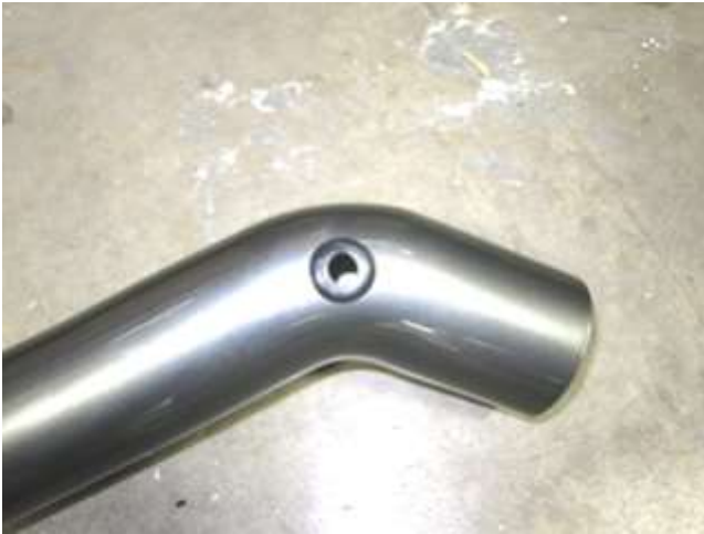
a. Install the grommet(784646) into the AEM intake tube.

a. When installing the intake system, do not completely tighten the hose clamps or mounting hardware until instructed to do so.