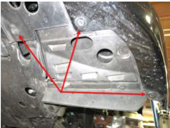
-the clip can then be pulled out together. Repeat for the three clips in front of the wheel shown above.