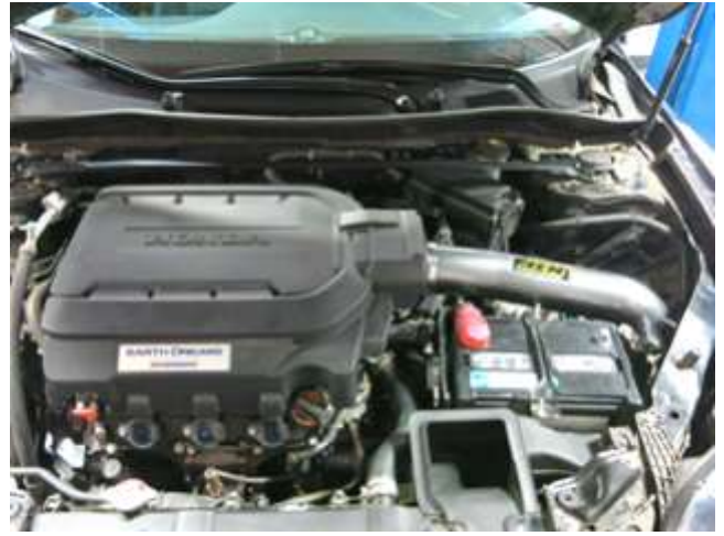
l. AEM INTAKE SYSTEM