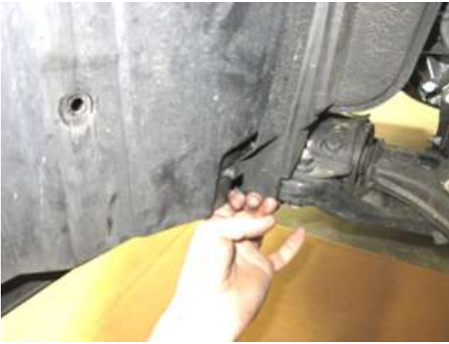
j. Separate the undercarriage panel from the fender liner by rotating them away from each other.