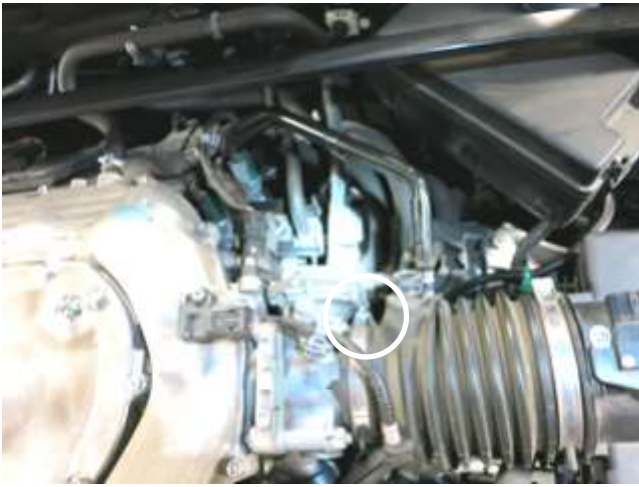
e. Loosen the hose clamp at the throttle body and remove the intake tube from the throttle body.