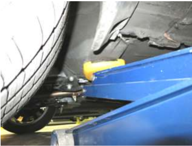
g. Jack vehicle up at a weight bearing location to lift driver-side wheel off the ground, then remove the wheel.