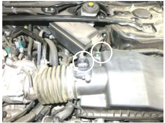
b. Depress the MAF electrical connector and squeeze the green clip to remove the wiring harness from the stock air box.