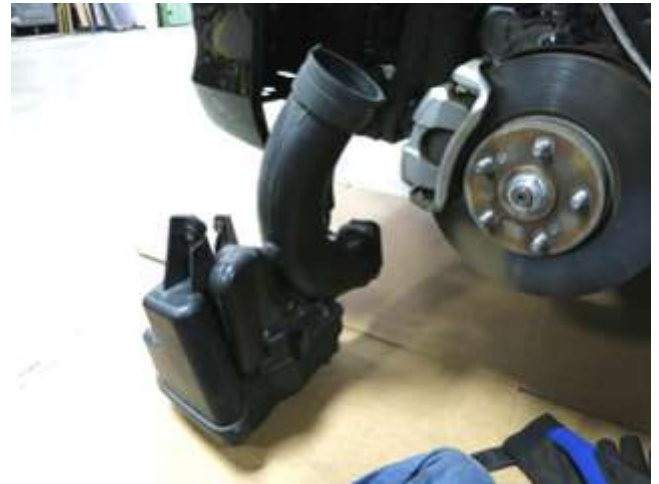
-and remove the bolt on the right. The resonator can then be pulled out as shown above.