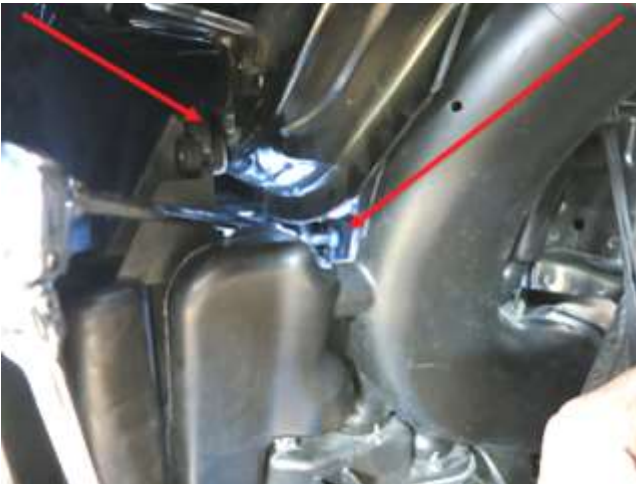
l. First remove the bolt shown above on the left, allowing you to lower the resonator. Using a short 10mm socket and u-joint on the end of at least 14" of extension