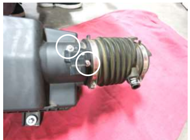
n. Remove the two screws securing the MAF to the stock air box. These will be reused in step 3c.