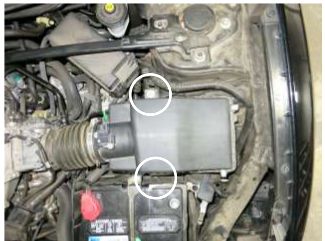
d. Remove the two bolts circled that secure the air box to the vehicle.