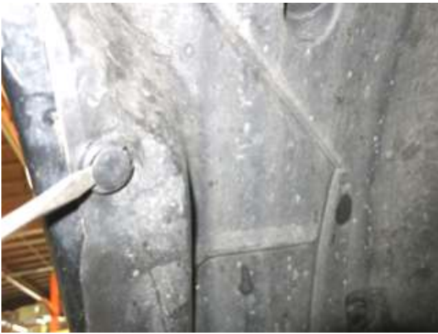
i. drivers on both sides, one after the other and twisting until one piece separates from the other. Both pieces of