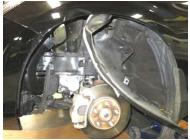
k. Once the fender liner is free, it can fold neatly back behind the brake assembly as shown.