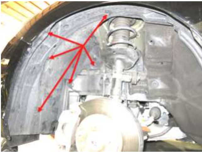
h. Using a flat screw driver, disconnect the nine trim panel clips shown above. Disconnect by inserting screw-