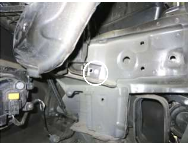
m. Remove the bolt securing the above bracket. This bolt will not be reused.