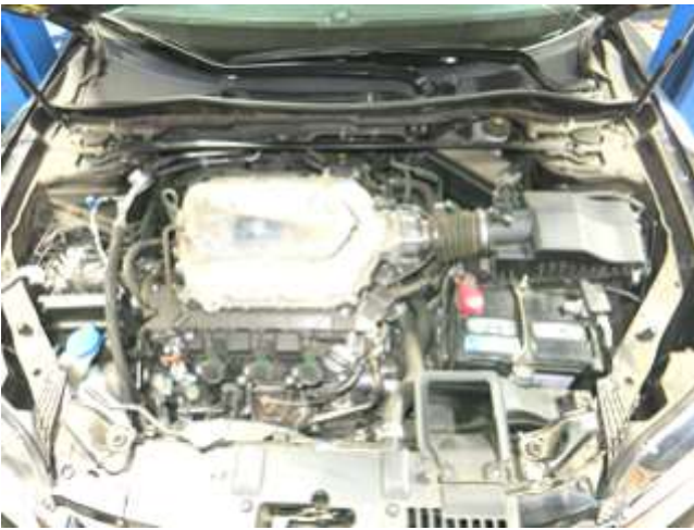
a. Remove the engine cover by lifting straight up.