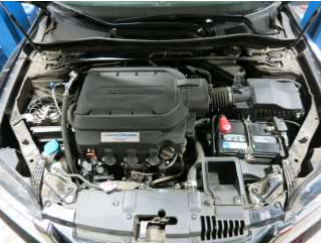
k. STOCK INTAKE SYSTEM