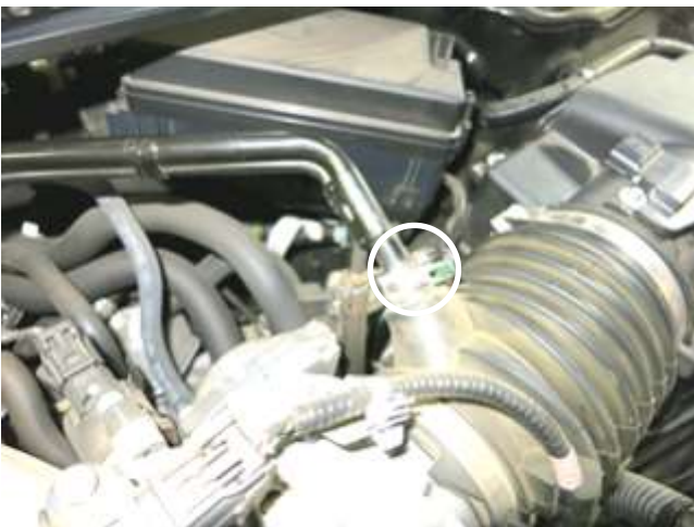
c. Squeeze the spring clamp and remove the vent line from the stock intake tube. This will be reused in step 3f.