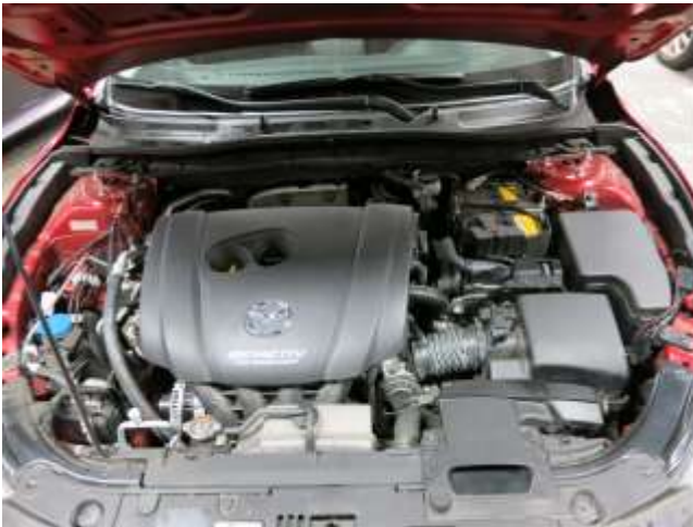
m. Factory air induction system.