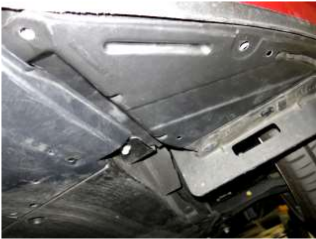
l. Reinstall the lower plastic covers and secure with previously removed hardware. Check final clearance and tighten the hose clamp on the hump hose.