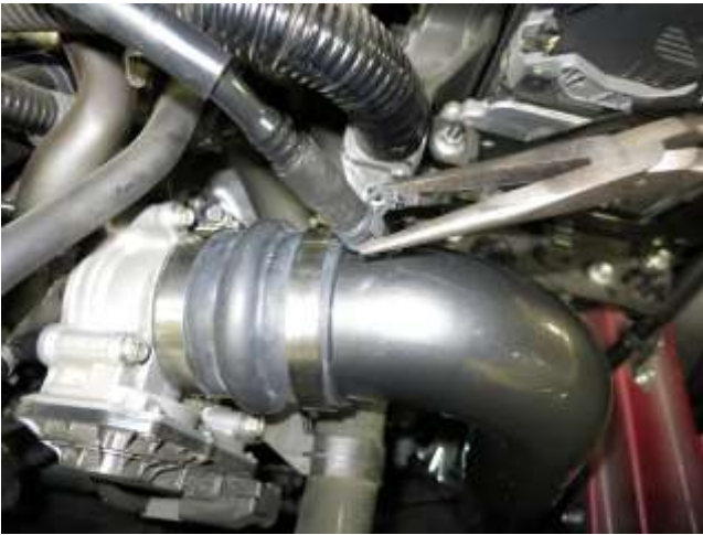
k. Trim 3/4 inch off the provided hose(AEM-5-1002) and install it onto the intake tube along with the spring clamp (08552). Connect the plastic hard line to the hose.