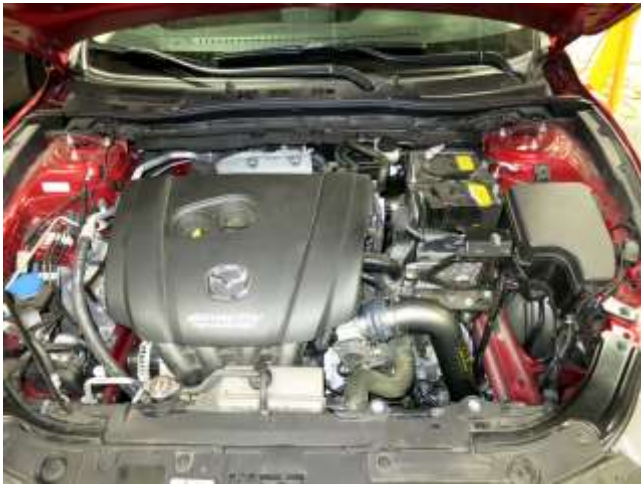
n. Finished installation of AEM Intake System.