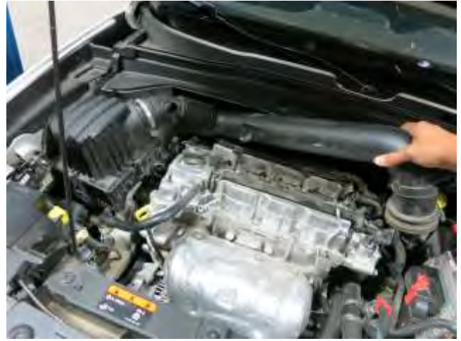
f. Carefully remove the stock intake assembly from the engine bay.