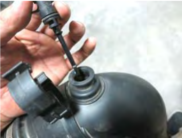
g. Remove the IAT sensor by tilting the lock tab away from the step feature and twist counter-clockwise .