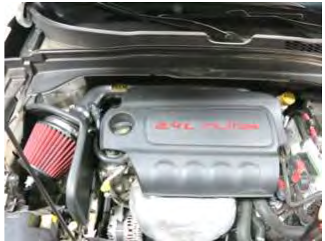
p. Finished installation of AEM Intake System.