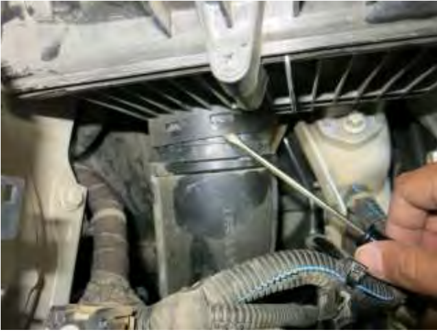
e. Use a flathead screwdriver to detach the inlet duct from the lower air box.