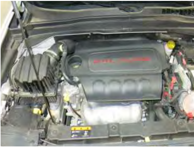
o. Factory air induction system.