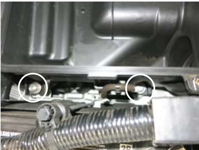
g. Loosen the (2) bolts that secure the lower air box to the vehicle.