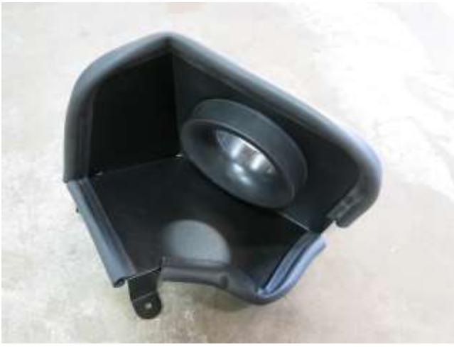
e. Install the filter adapter into the heat shield and secure with the supplied hardware as shown in the exploded view.