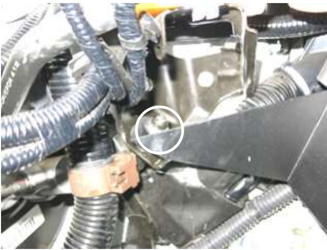
i. Install the heat shield into the vehicle and align the rear tab/rubber grommet with the stock mounting location. Note: Soapy water will help with installation.