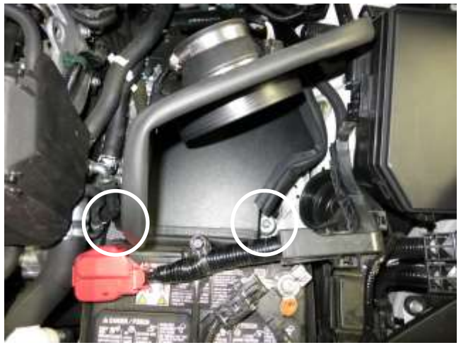
j. Align the front two heat shield tabs with the rubber mounts and install the supplied washers and nuts. Tighten the nuts at this time.