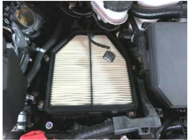
f. Lift the upper air box and stock intake hose out of the vehicle. Then, remove the stock air filter.