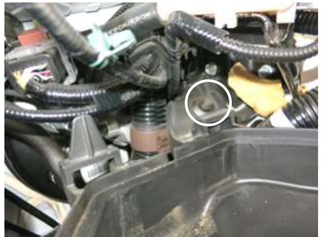
h. Pull the rear of the lower air box off the push in grommet located underneath the brake fluid reservoir. Note: Soapy water can help disengaging the grommet from the stud.