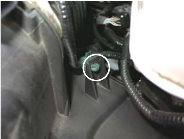
e. On the upper air box, disconnect the push-in tab that secures the MAF sensor wire loom to the upper air box.