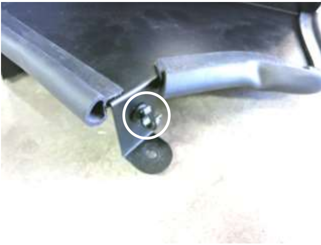
g. Install the clip that was removed in step 2o. into the heat shield as shown.