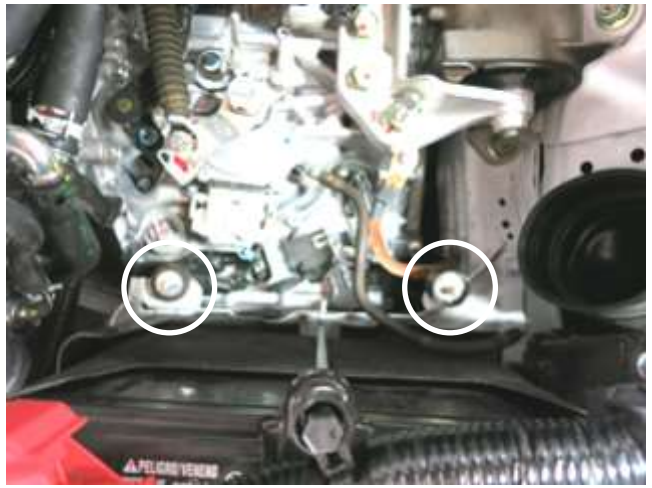
h. Install the two rubber mounts into the vehicle. The shorter mount will go closest to the engine.