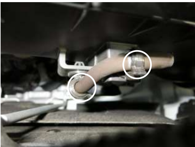
i. Located in the front of the lower air box, remove the vent hose from the clips.