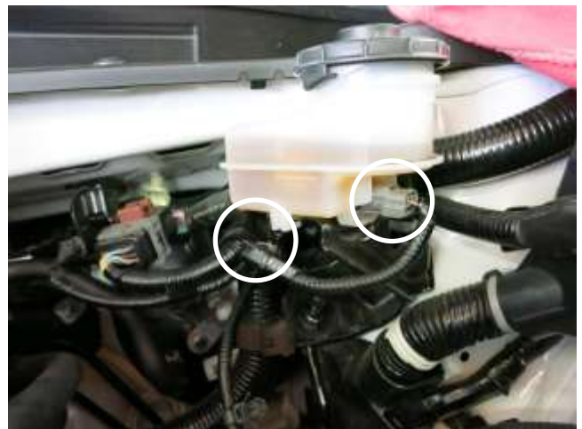
j. Disconnect the electrical connector and the clip securing the wire loom to the brake reservoir.