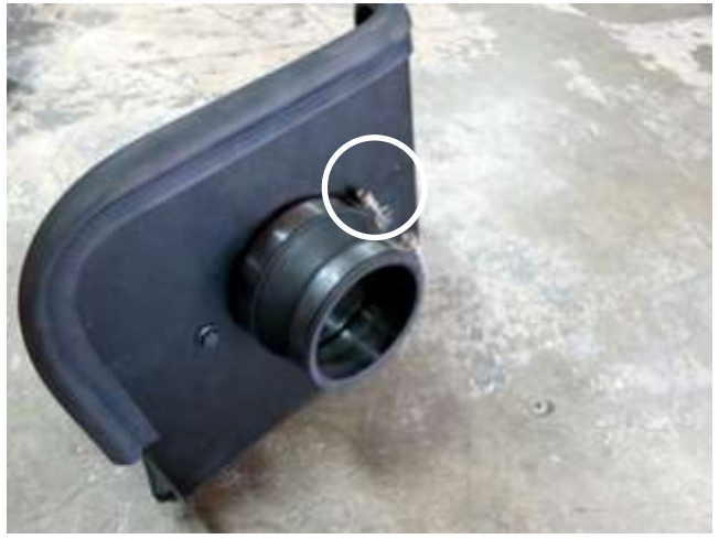
f. Install the supplied coupler onto the filter adapter with the correct hose clamps. Tighten the hose clamp closest to the heat shield at this time.