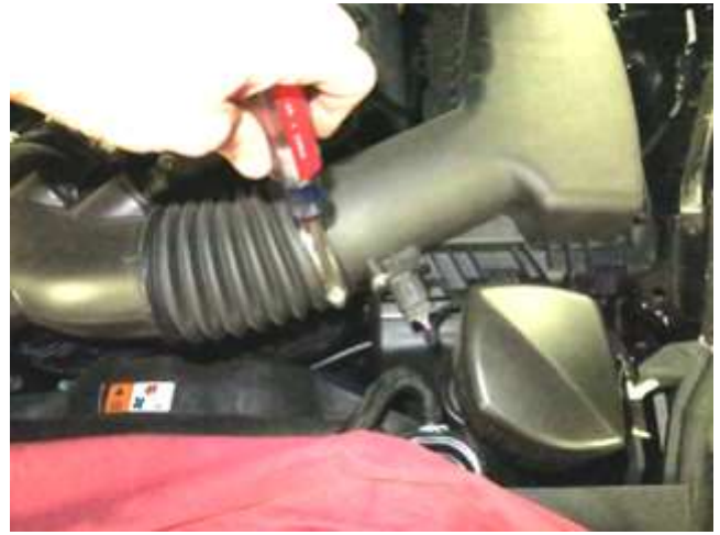
f. Loosen the clamp retaining the factory intake duct to the airbox and remove the duct.