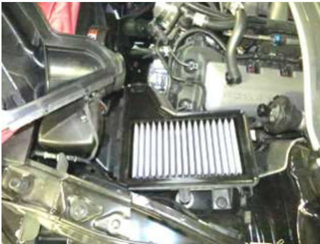
a. Disengage the clips securing the airbox lid and lift to replace the air filter. Reinstall the lid.