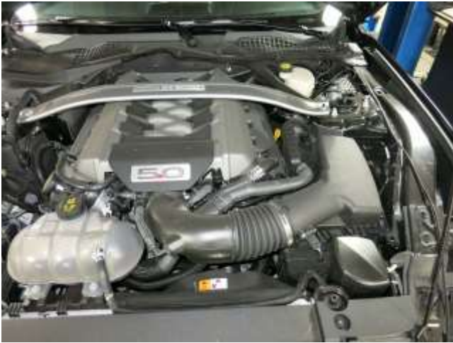
e. Factory air induction system.