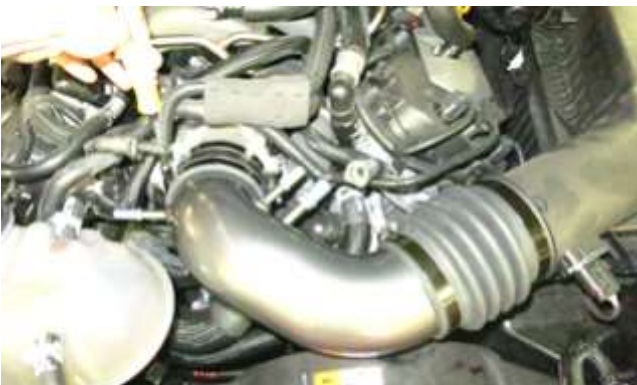
c. Install the intake tube with the coupler and clamps to the throttle body. Torque all clamps to 30 in-lbs.