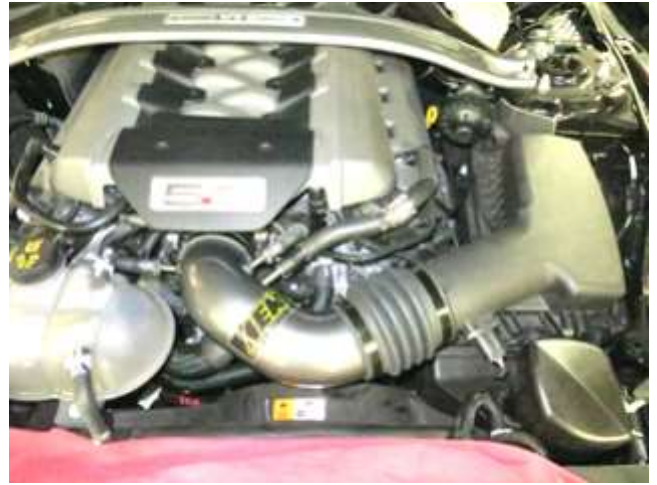
f. Finished installation of AEM Intake System.