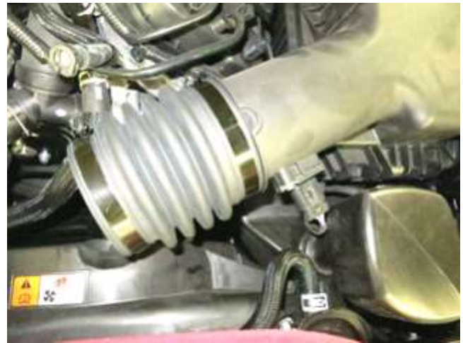
b. Install the bellows coupler and clamps on the airbox.