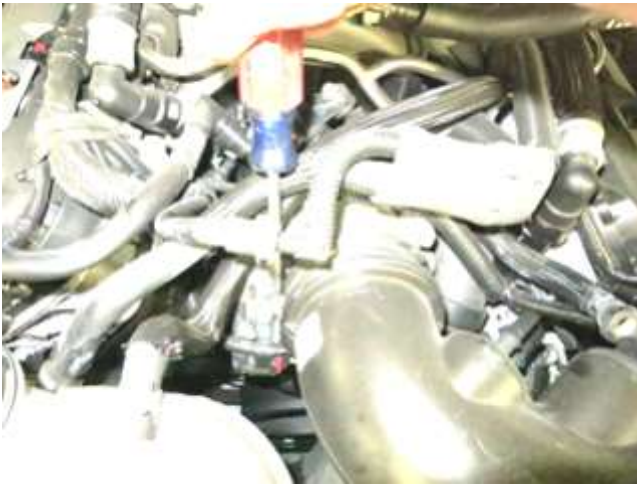
e. Loosen the hose clamp retaining the factory intake duct to the throttle body.