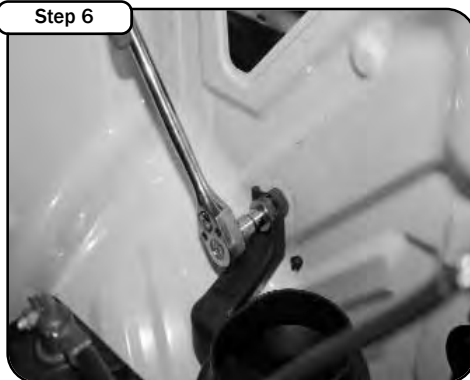
Step 6 Loosen but do not remove the bolt securing the air intake snorkel.