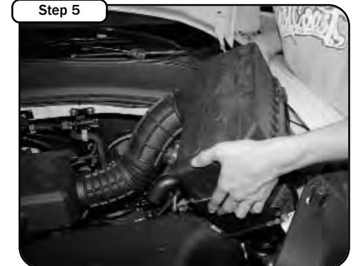
Step 5 Remove the airbox assembly out of the engine compartment.