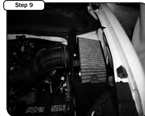
Step 9 Install intake filter into housing. Do not use any grease or oil to install air filter