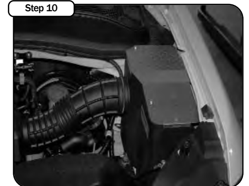
Step 10 Install the aluminum cover and secure with the supplied button head screws. Your installation is now complete. Make sure you tighten all clamps and check all electrical connections. Re-check periodically