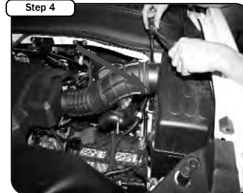
Step 4 Remove the 10mm bolt securing the back of the air box.