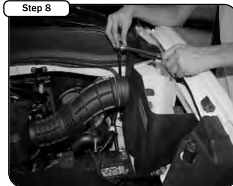
Step 8 Secure housing with supplied bolts and washers. Connect intake duct to the housing.