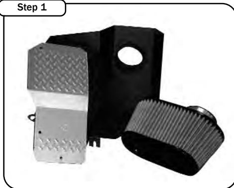
Step 1 Complete kit. Make sure all components listed are included prior to beginning installation.