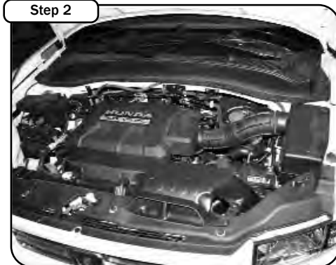
Step 2 Complete stock intake.