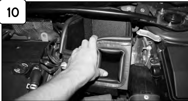
10 Install housing and position grommets on housing to factory fittings.

For replacement part(s) or "Restore Kit" please log on to takedausa.com P.O. Box 1719 Corona CA, 92878