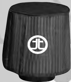
Pre Filter P/N: TP-7011B

Note: Filter Cleaning: When cleaning your Pro Dry S™ filter, be sure to use only "Restore Kit" (Takeda P/N: TP-7016C Pro Dry S™ cleaner only.)