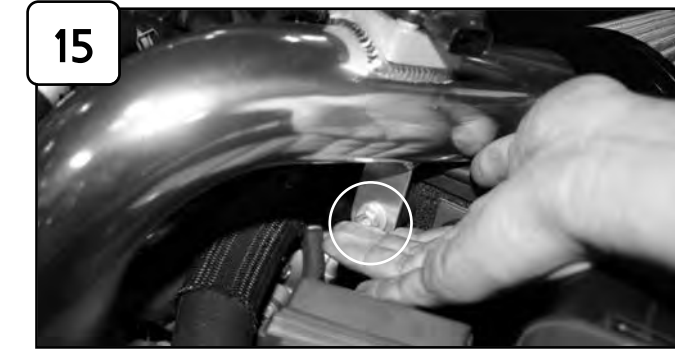
15 With M6 nut, wavy and flat washer provided, secure tab and tighten using 10mm socket or wrench.