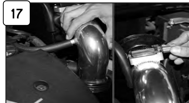
17 Install provided 5/8" hose to engine and tube. Reconnect MAF sensor harness. Reconnect battery terminals.