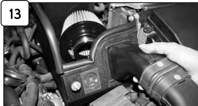
13 Place filter in housing. Attach ram air assembly to housing.