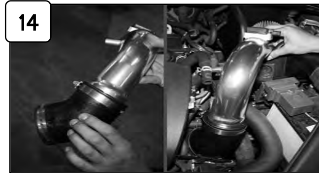
14 Attach elbow coupling with clamps to tube. Position tube to throttle body and tab on tube to isolation mount.