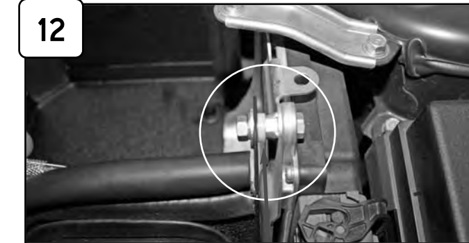
12 Attach tab on housing to screw on ECU bracket. Make sure nylon spacer is between tab and ECU. Secure tab using M6 nut, wavy and flat washer. Tighten using 10mm socket or wrench.