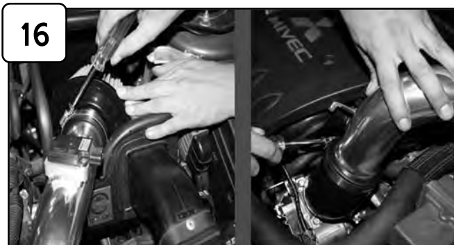
16 Install filter and tighten using 5/16" nut driver. Tighten all remaining clamps using 5/16" nut driver.