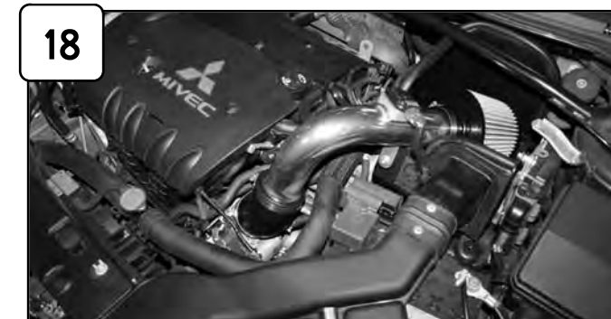
18 The installation of your Takeda performance intake is now complete. Please check all components and re-tighten if necessary. Thank you for choosing Takeda!