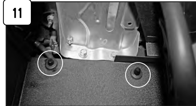
11 Make sure housing is secure on fittings.