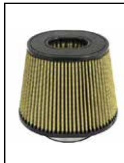
Pro-Guard 7 Air Filter