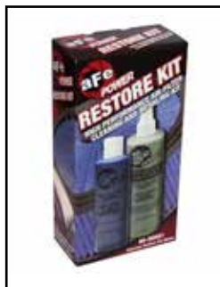
Blue Restore Kit