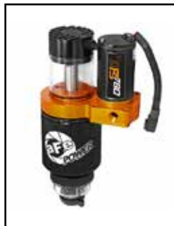
Diesel Fuel System