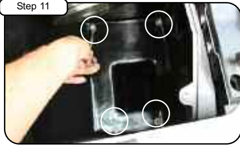
Use the 4 bolts from step 9 and tighten housing using 10mm socket or wrench.