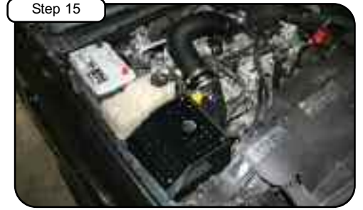
Your installation is now complete. Make sure you tighten all clamps and check all electrical connections periodically. Thank you for choosing aFe!

Note: Filter Cleaning and Re-oiling: When cleaning your aFe filter, be sure to use only aFe's "Restore Kit" ( aFe P/N: 90-50001 blue oil aerosol, aFe P/N: 90-50501 blue oil squeeze) or aFe P/N: 90-59999 Pro Dry S™ cleaner only.) Filter Replacement P5R™ P/N 24-90038 (black w/ blue media) or Pro Dry S™ P/N 21-90038 (black w/white media) Pro Dry S™ cleaning: see cleaning instruction sheet 06-00074. For replacement part(s) or "Restore Kit" please call aFe sales/tech support @ 951-493-7100