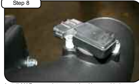
Install MAF sensor into new tube. Use provided screws, nylon spacers and gasket and tighten using phillips screwdriver. Note: Make sure nylon spacers are between sensor and tube.