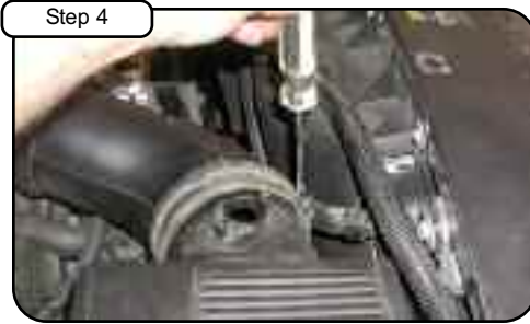
Loosen clamp on air box with 5/16" nut driver.