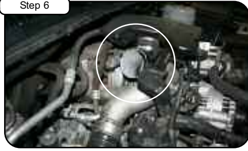
Loosen clamp on turbo with 5/16" nut driver. Remove factory intake tube.