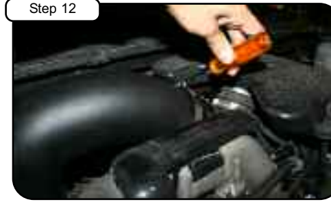
Install 05-01072 tube to turbo side with 05-00632 reducer coupling and clamps provided and position to tube on housing. Do not tighten clamps.