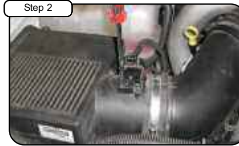
With T20 torx bit provided, loosen the two screws holding in MAF sensor.