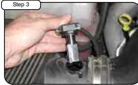
Disconnect MAF sensor harness and remove carefully. Note: MAF sensor can be damaged easily!