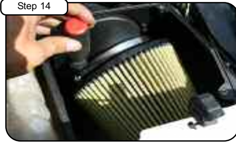
Install air filter and tighten using 5/16" nut driver. Attach cover to housing using provided button head screws. Tighten using 5/32" allen key. Reconnect battery terminals.