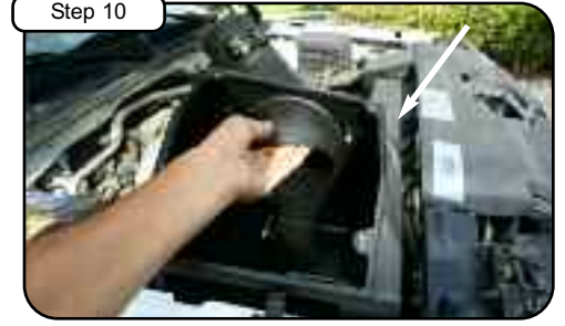
Install housing with tube into vehicle and position.