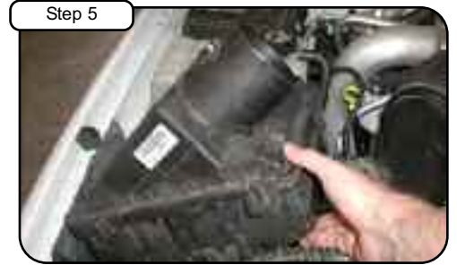
Lift and pull air box out of vehicle.