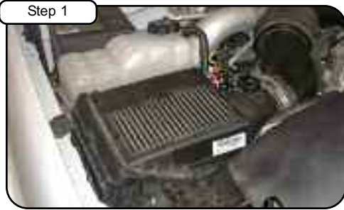
Complete Stock Intake. Disconnect battery before install.

advanced FLOW engineering™ P.O. Box 1719 Corona, CA 92878 Support: 951-493-7100 aFepower.com