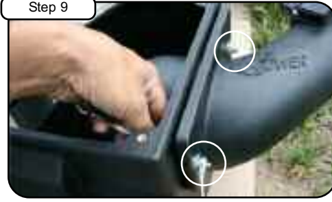
Attach tube to outside of housing using screws, nuts and fender washers provided and tighten using 7/16" socket or wrench.