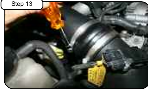
install hump coupling with clamps provided and secure. Tighten all clamps using 5/16" nut driver. Reconnect MAF sensor harness.