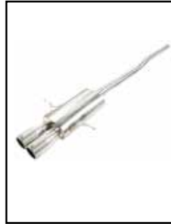
aFe Cat-Back Exhaust