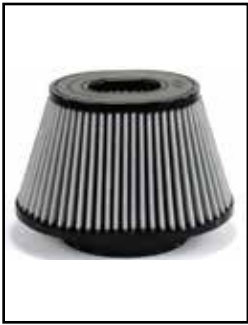
Pro DRY S Air Filter