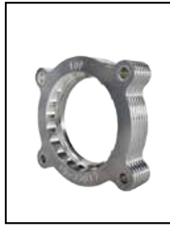
Throttle Body Spacer