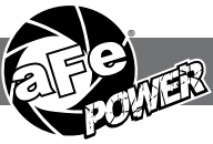
Pro DRY S Air Filter