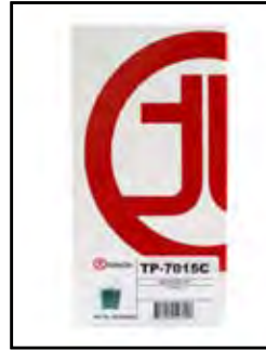
Takeda Restore Kit