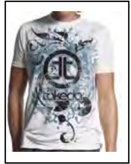
Takeda Grundge Tee

P/N: TP-7004T MED TP-7005T LRG TP-7006T XLG TP-7007T 2XL