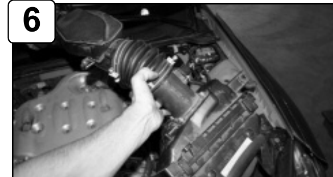
Carefully remove stock air box assembly out of vehicle. (ram scoop optional.)