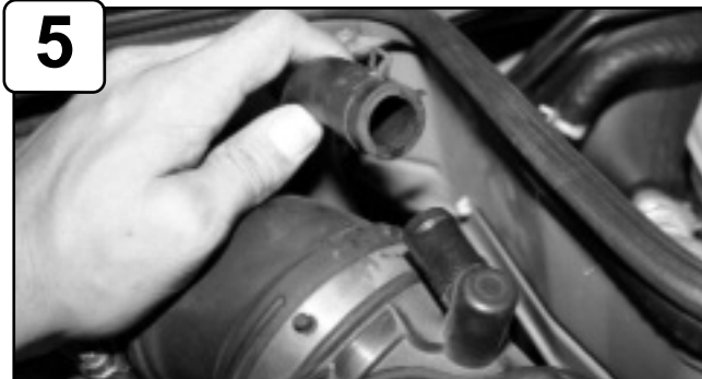
Remove crank case line from stock intake tube. Disconnect MAF sensor harness.