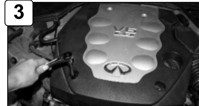
Loosen the 4 bolts using 10mm socket or wrench holding in engine cover and remove.