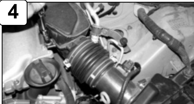
With 10mm socket and ratchet, remove the two 10mm bolts from the OEM intake tube and airbox. Loosen the top of OEM intake tube w/ 5/16" nut driver.