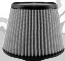
Replacement Filter P/N: TF-9006D