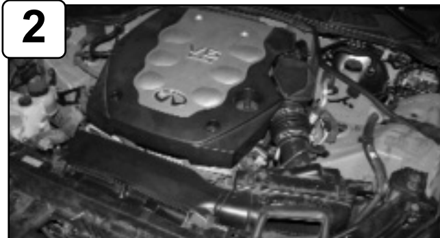
Complete Stock intake. Please disconnect battery terminals before installation.