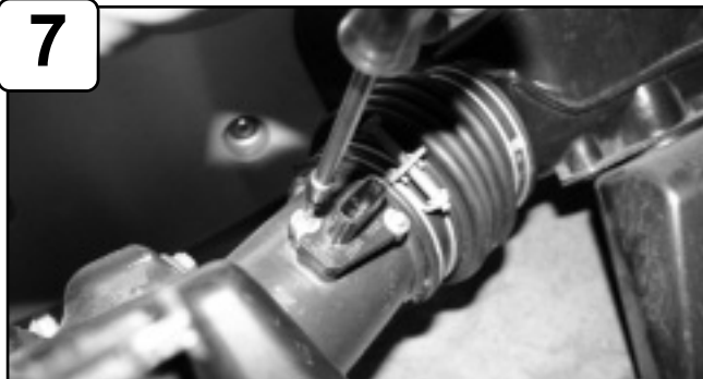
With T20 Torx bit, loosen the 2 bolts holding in MAF sensor. Carefully remove sensor out of stock intake.