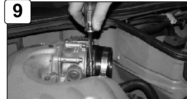
Install coupler with clamps to throttle body. Tighten clamp on throttle body side only.