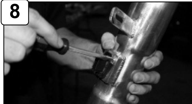
With provided M4 screws, install MAF sensor to new intake tube.