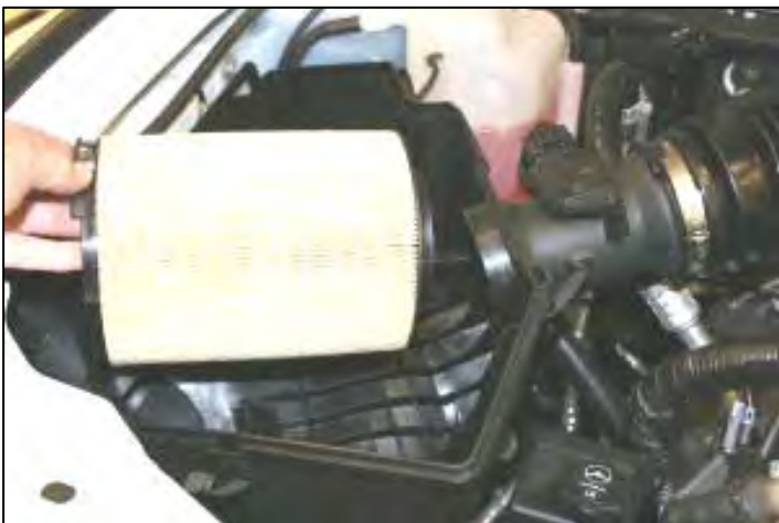
3. Remove the factory air filter from the airbox. Do not remove the factory airbox base. The factory base is required to mount the Airaid Quick Fit Panel.