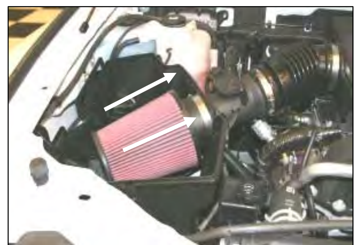
6. Make sure the filter and the hose clamp are pushed close to the factory airbox wall, and tighten the hose clamp as shown. Do Not over tighten.