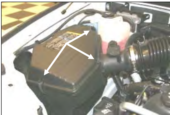
1. Disconnect the negative battery cable. Unhook the three clips that hold down the air box lid.