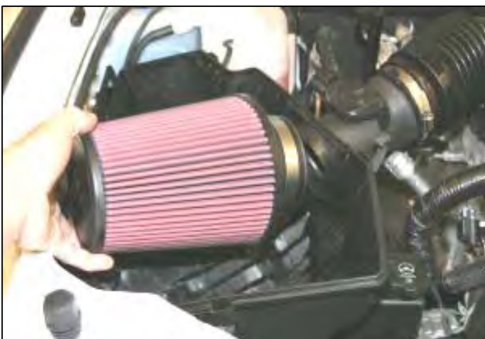
5. Install the Airaid Premium Filter (#1) on the factory intake tube.