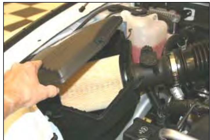
2. Remove the lid by lifting, and sliding it out of the tabs on the side of the airbox.