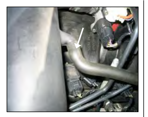
10. Connect the factory breather hose to the Modular Intake Tube & secure hose with the