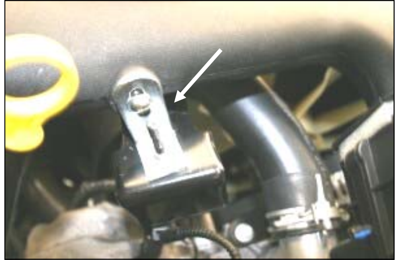
8. Install the L-bracket (#3) over the factory stud re-using the nut removed in step #1. Next install the button head bolt (#4) and washer (#5) thru the L-bracket, and into the tube. Leave loose until final adjustments have been made.