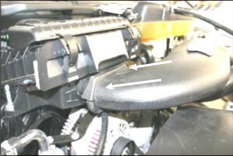
7. Install the Airaid Modular Intake Tube (#2) into the factory airbox. It will “snap” into place.