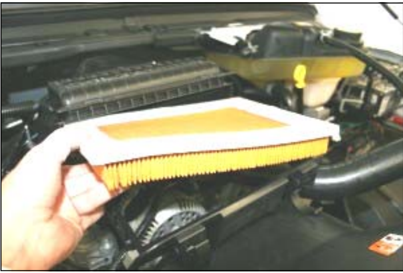
5. Slide the tray out of the factory airbox and remove the factory air cleaner.