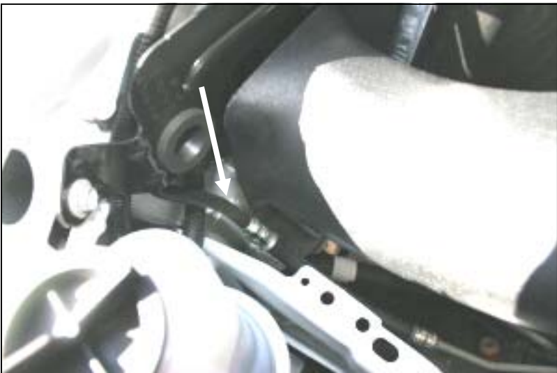
9. Due to inconsistent factory tolerances, some minor adjustment may be necessary to the factory A/C line so it will clear the Airaid MIT near the radiator support.. When all adjustments have been completed, tighten the nut, and button head bolt at the L-bracket.