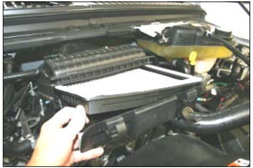
6. Install the Airaid Premium Filter (#1) into the factory airbox tray, slide it back in, and re-latch the two clips.