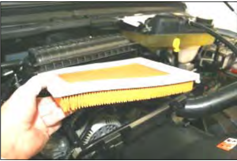
5. Slide the tray out of the factory airbox and remove the factory air cleaner.