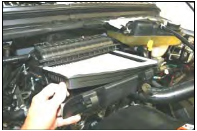
6. Install the Airaid Premium Filter (#1) into the factory airbox tray, slide it back in, and re-latch the two clips.