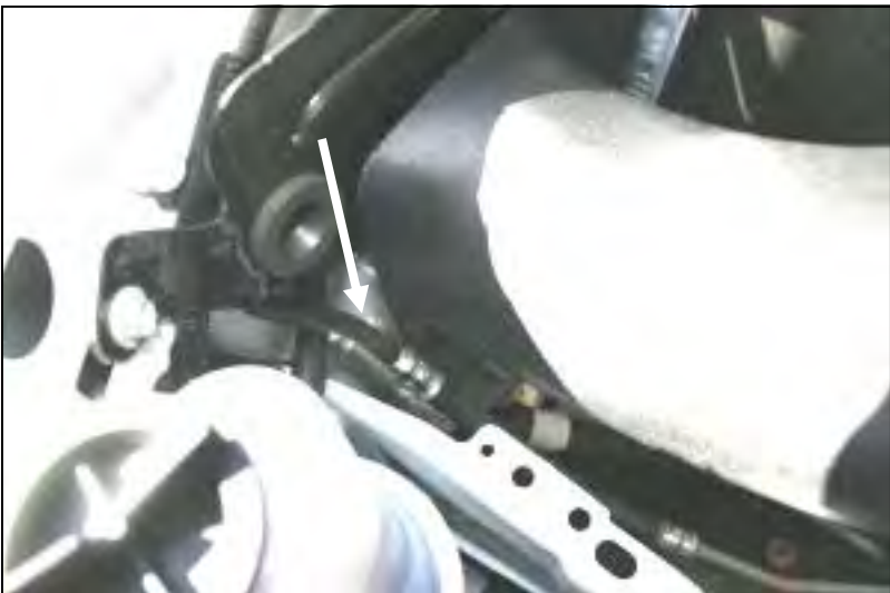
9. Due to inconsistent factory tolerances, some minor adjustment may be necessary to the factory A/C line so it will clear the Airaid MIT near the radiator support.. When all adjustments have been completed, tighten the nut, and button head bolt at the L-bracket.