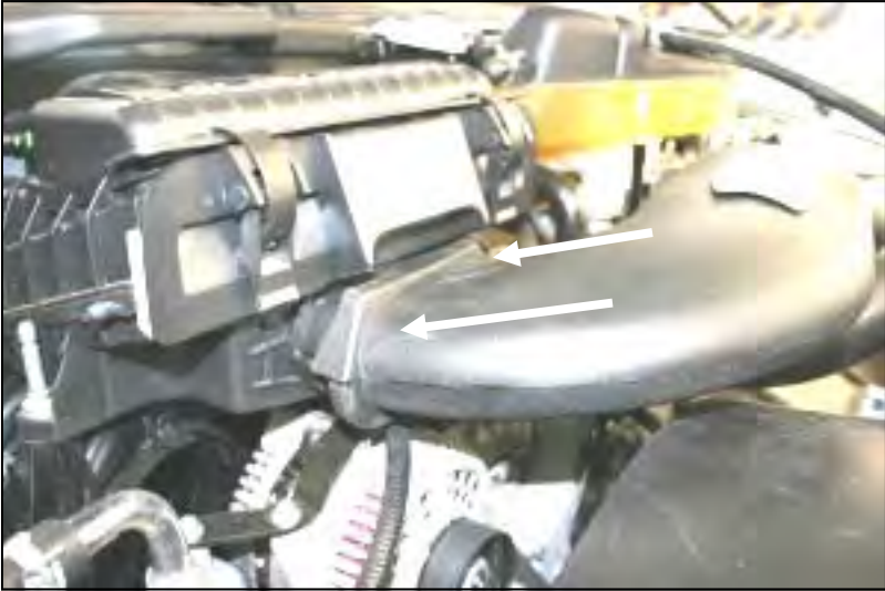
7. Install the Airaid Modular Intake Tube (#2) into the factory airbox. It will “snap” into place.