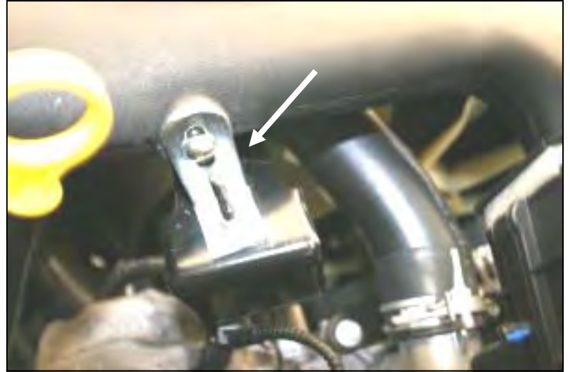
8. Install the L-bracket (#3) over the factory stud re-using the nut removed in step #1. Next install the button head bolt (#4) and washer (#5) thru the L-bracket, and into the tube. Leave loose until final adjustments have been made.