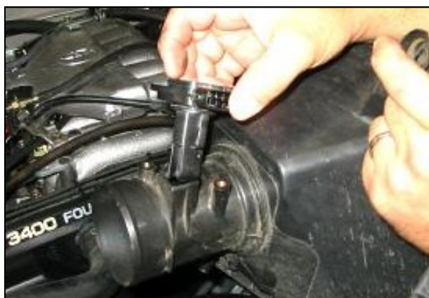
5. Loosen the two screws on the Mass Air Sensor and remove the sensor from the factory air box. Retain sensor for later use.