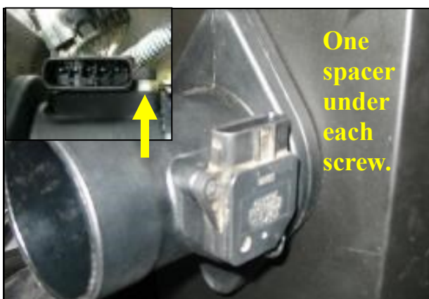
8. Using the two 8-32 Allen head screws and two plastic spacers provided, mount the factory Mass Air Sensor to the Airaid filter adapter tube. ( Note: the plastic spacers are placed between the Mass Air Sensor and the Filter Adapter Tube with the screws sliding through the spacers. )