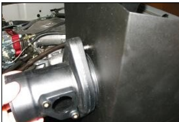
7. Using two supplied 1/4-20 bolts and washers, mount the Airaid filter adapter to the Airaid Cool Air Dam.