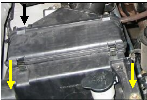
4. With a 12mm socket, remove the three bolts securing the factory air box assembly & remove the factory air box assembly from vehicle.