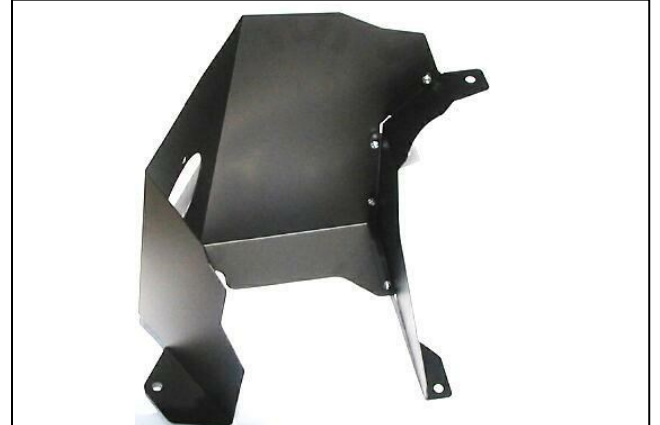
6. Assemble the Airaid Cool Air Dam using four small screws, washers, and nuts provided.