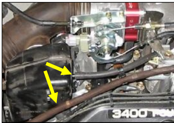
2. Remove factory vacuum lines / hose from the factory air box and intake tube. ( Note: Retain the 3/8" vacuum hose )