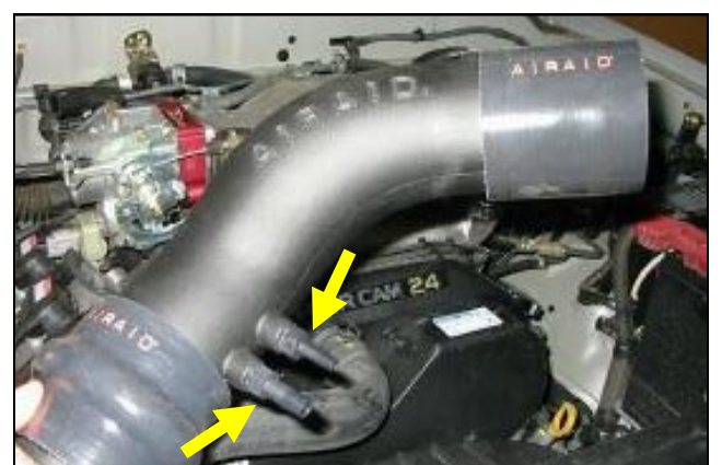
9. Install two supplied 1/4" NPT barbed fittings in Airaid intake tube. ( Note: Install 3/8" fitting in the forward hole and the 1/4" fitting in the back hole ) Slide hump hose and two #52 hose clamps on large end of intake tube and slide coupler with two #48 hose clamps on small end of tube. ( Note: leave all hose clamps loose for final assembly )