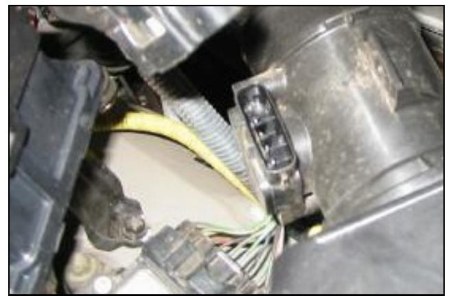
3. Disconnect the electrical connector from the Mass Air Sensor.