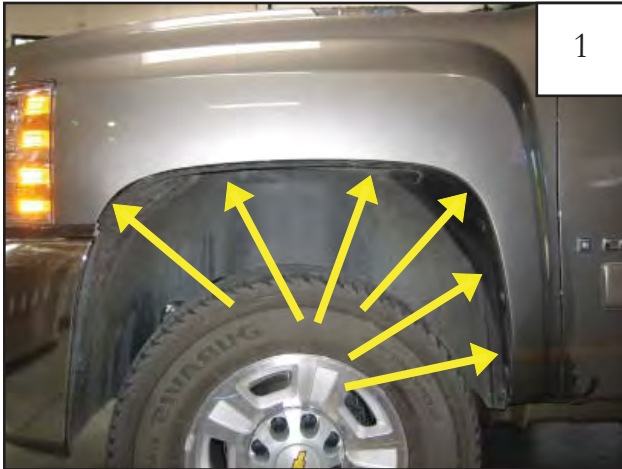
Remove six factory fasteners with a pry tool.