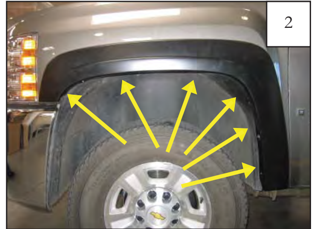
Install six tuflocks using a #2 stubby screwdriver.