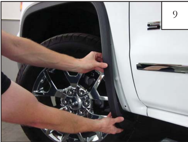
Starting at the lower rear end of the factory wheel arch molding, firmly grip part and pull to remove from vehicle. Note: You will hear popping sounds as the factory fasteners release from vehicle. This is normal.