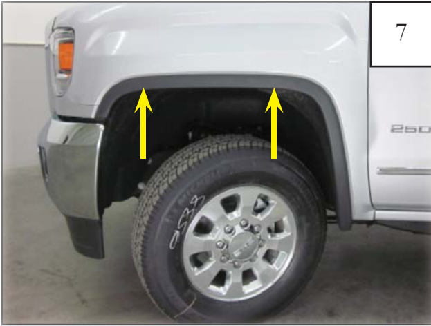
Remove two fasteners along top of factory wheel arch molding using a T-15 Torx bit.