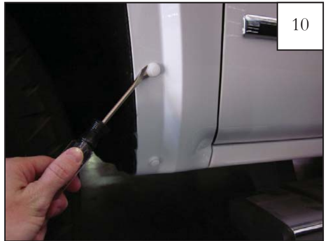
Use a pry tool to remove any remaining factory fasteners that may have stayed on the vehicle during the removal process.