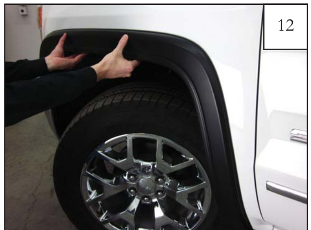
Hold Front Flare up to wheel well to confirm fit. Do not install fasteners at this time.