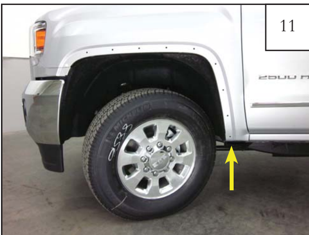
Reinstall factory fastener removed in step 9 using a 1/2" socket and wrench.