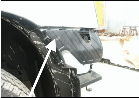
Step 1 Remove plastic shield above chrome bumper

Step 1: Remove factory bumper + Factory plastic shield above the chrome bumper. Note: Do not remove factory tow hooks.