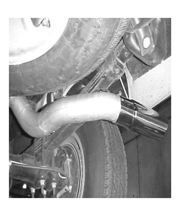
INSTALL TURNOUT PIPE #E. INSERT WELDED HANGER INTO RUBBER GROMMET. ATTACH CLAMP #F TO CONNECT TAILPIPE TO TURN OUT PIPE. (DO NOT TIGHTEN CLAMP) ADJUST TURNOUT PIPE SO IT EXITS ON THE SIDE OF THE VEHICLE AT A LEVEL POSITION.

INSTALL DRIVERSIDE HEADPIPE #A AND PASSENGER SIDE HEADPIPE #B WITH O2 SENSOR, OVER THE FACTORY HEADPIPES NO LESS THAN 1 ½" AND NO MORE THAN 2". INSERT WELDED HANGER INTO RUBBER GROMMET. USE CLAMPS #I TO CLAMP DOWN HEADPIPES.