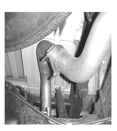
SLIP OVERAXLE TAILPIPE #D INTO THE OUTLET OF THE MUFFLER NO LESS THAN 1 ½" AND NO MORE THAN 2". ATTACH CLAMP #F AT THE MUFFLER OUTLET ( DO NOT TIGHTEN ). INSERT WELDED HANGER INTO RUBBER GROMMET.

UNBOLT THE FACTORY O2 SENSOR BEHIND THE PASSENGER SIDE CONVERTER ON THE STOCK HEADPIPE. REMOVE YOUR STOCK EXHAUST BY UNBOLTING THE DRIVERSIDE HEADPIPE APPRX 36" FROM THE FRONT OF THE MUFFLER FORWARD. CUT THE PASSENGER SIDE HEADPIPE 3 1/2" FROM THE CONVERTER BACK. USE A HACKSAW TO REMOVE OLD EXHAUST. LEAVE ALL RUBBER GROMMENTS IN PLACE. FOR EASIER REMOVAL OF THE STOCK EXHAUST WE RECOMMEND USING WD-40 LUBRICANT ON ALL BOLTS AND HANGERS AND CUT THE FACTORY OVER AXLE PIPE JUST BEHIND THE MUFFLER.