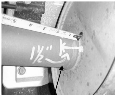
Cut here to remove for 00-02

MEASURE 1 1/2' IN FRONT OF THE MUFFLER AND CUT.