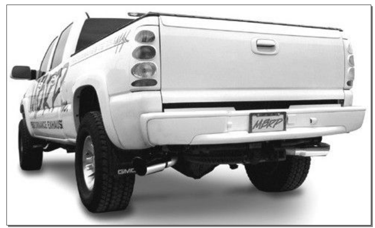
"PRO SERIES" exhaust shown. Tips are not included with "INSTALLER" or "XP SERIES" kits.