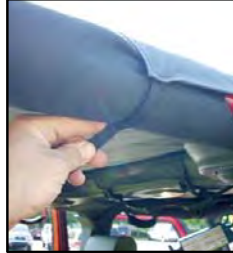
Step 6 (B)

Step (6) : Attach side Velcro straps over and around roll bar and plastic door brackets as shown. Note: Straps will need to run between plastic side rail on summer top and plastic door brackets as shown. If top is used without plastic door brackets then Velcro straps are to be looped around side roll bars and secured.