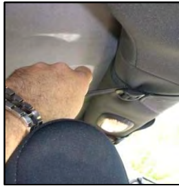
Step 8 (B)