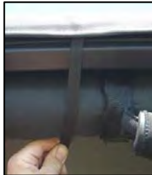
Step 6 (A)

Step (6) : Attach side Velcro straps over and around roll bar and plastic door brackets as shown. Note: Straps will need to run between plastic side rail on summer top and plastic door brackets as shown. If top is used without plastic door brackets then Velcro straps are to be looped around side roll bars and secured.