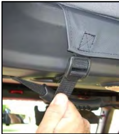
Step 8 (A)

Step (8) : With the left and right side Velcro straps secured and plastic side rails secured proceed to pull the center cross bar straps, rear side straps, and side straps tight.