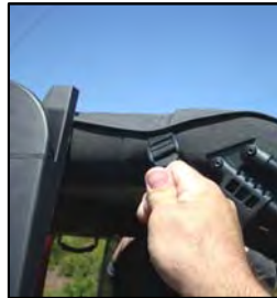
Step 8 (C)