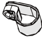
1 (qty 6)