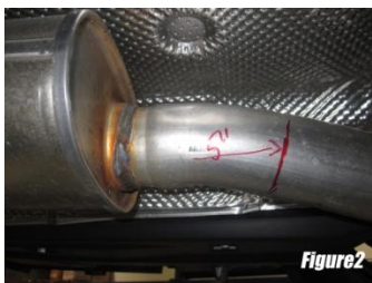
Figure 2: measure 5" inches from behind the passenger side muffler and cut

3. once you have removed the factory exhaust you will need to cut off the factory butterfly valves at specific locations. Figure 1: measure 6" inches from behind the driver's side muffler and cut