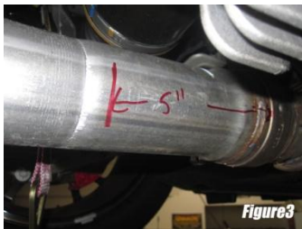
Figure 3: measure 5" inches from behind the driver's side valve and cut

Figure 2: measure 5" inches from behind the passenger side muffler and cut