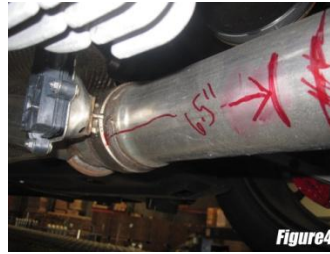
Figure 4: measure 6.5" inches from behind the passenger side valve and cut

Figure 3: measure 5" inches from behind the driver's side valve and cut