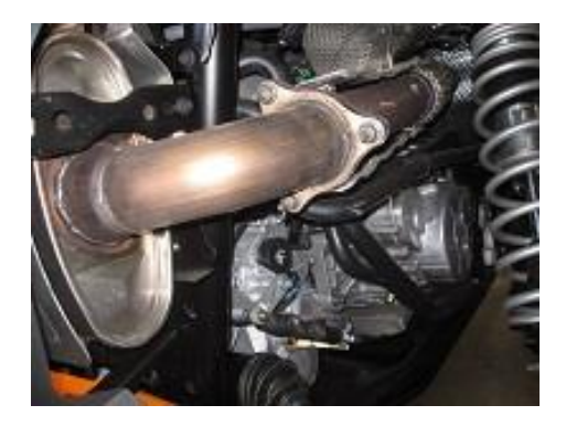
2. Once you have removed the heat shield loosen the factory exhaust. Unbolt the headpipe entirely and remove the factory exhaust.

1. Disconnect the negative battery cable before removal of the OEM Exhaust. This will allow the computer to reset and recognize the new exhaust. Lay out the exhaust on the floor so it looks like the drawing and compare parts with manual. Remove the factory exhaust by unbolting the factory rear heat shield bumper behind the factory muffler. You will re use the hardware for the Gibson install. Disconnect the 4 factory springs and remove the factory exhaust. Do not damage the factory exhaust gasket. You will re use this gasket.