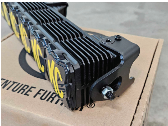
PRE-ASSEMBLE FLEX ERA LIGHT BAR WITH THE END MOUNTS & DESIRED BEAM PATTERN.

- TORX T45 BIT - RATCHET WRENCH - 5MM ALLEN WRENCH - 12MM OPEN WRENCH - #2 PHILLIPS SCREW DRIVER - MARKER - BLADE/SIDE CUTTER