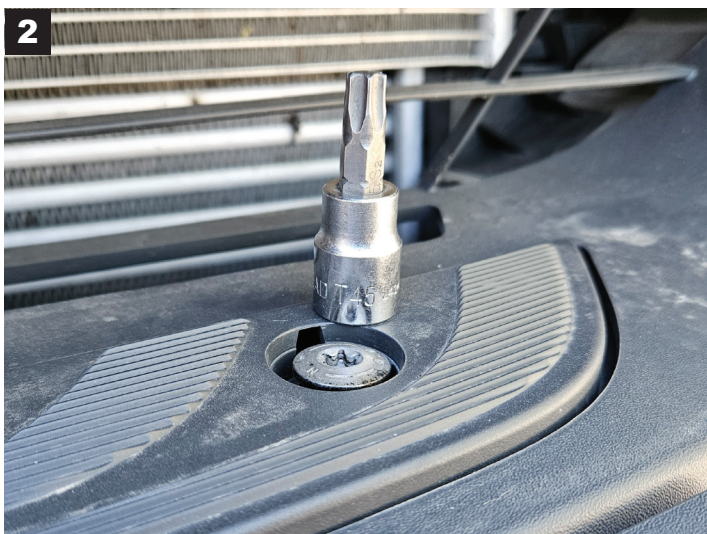
2 USING THE TORX T45 BIT, REMOVE THE TWO M8 TORX SCREWS LOCATED ON THE LARGE LOWER GRILL OPENING ON TOP OF THE BUMPER.