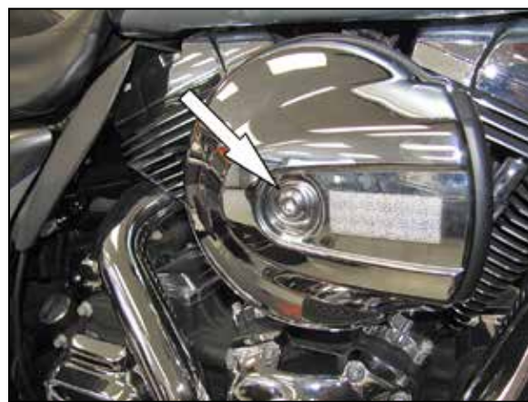
3. Remove the bolt securing the air filter cover and then remove the cover from the vehicle.