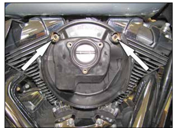
5. Remove the two factory crank case breather bolts and then remove the filter back plate from the vehicle.

NOTE: K&N Engineering, Inc., recommends that customers do not discard factory air intake.