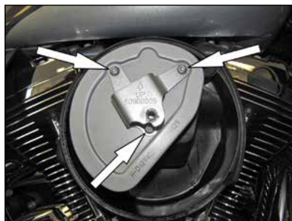
4. Remove the three bolts which secure the factory air filter to the base plate and then remove the air filter from the vehicle.