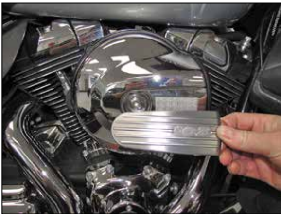
2. Remove the decorative badge from the air filter cover.

1. Turn off the ignition and disconnect the negative battery cable. NOTE: Disconnecting the negative battery cable erases pre-programmed electronic memories. Write down all memory settings before disconnecting the negative battery cable. Some radios will require an anti-theft code to be entered after the battery is reconnected. The anti-theft code is typically supplied with your owner's manual. In the event your vehicles anti-theft code cannot be recovered, contact an authorized dealership to obtain your vehicles anti-theft code.