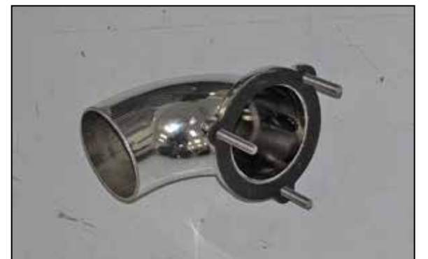
6. Install the three provided tube mounting bolts into the K&N® intake tube and then install one of the two provided gaskets onto the bolts.

NOTE: K&N Engineering, Inc., recommends that customers do not discard factory air intake.