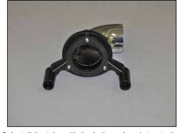
8. Install the tube with the bolts and gasket onto the tube adapter and then install the remaining gasket onto the adapter.