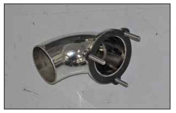
6. Install the three provided tube mounting bolts into the K&N<sup> \otimes </sup> intake tube and then install one of the two provided gaskets onto the bolts.

NOTE: K&N Engineering, Inc., recommends that customers do not discard factory air intake.