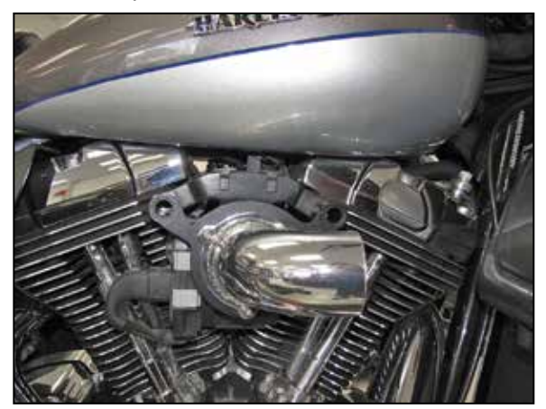
9. Apply one drop of the provided thread locker onto the tube mounting bolts. Install the complete tube and adapter assembly onto the throttle body and secure with the tube mounting bolts. NOTE: Do not completely tighten the tube bolts at this time.