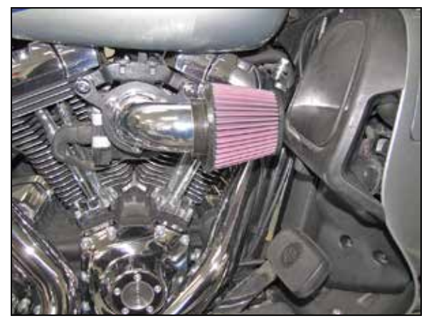
11. Install the K&N<sup>®</sup> air filter and secure with the provided hose clamp.

10. Install the two remaining O-Rings and K&N<sup>®</sup> breather bolts into the tube adapter. Tighten all of the hardware at this time.