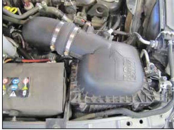
13. Reconnect the vehicle's negative battery cable. Double check to make sure everything is tight and properly positioned before starting the vehicle.

14. The C.A.R.B. exemption sticker, (attached), must be visible under the hood so that an emissions inspector can see it when the vehicle is required to be tested for emissions. California requires testing every two years, other states may vary.