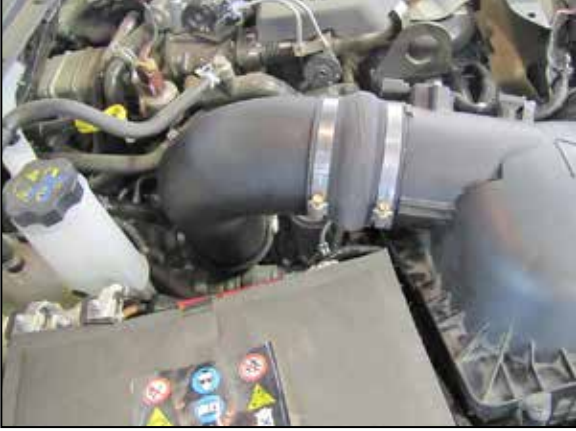
11. Install K&N® intake tube into the factory turbo inlet hose and then into coupling hose (08695). Secure K&N® intake tube with provided hose clamps.