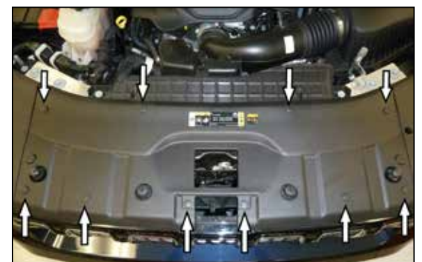
6. Remove the ten push pins that secure the radiator cowl cover and then remove the cover from the vehicle.