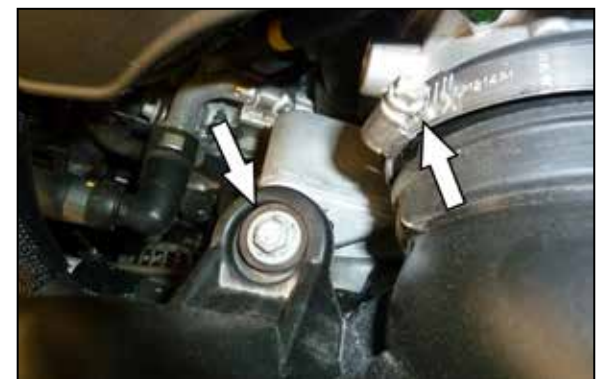
5. Loosen the hose clamp that secures the intake tube to the throttle body and then remove the bolt that secures the intake tube to the engine.