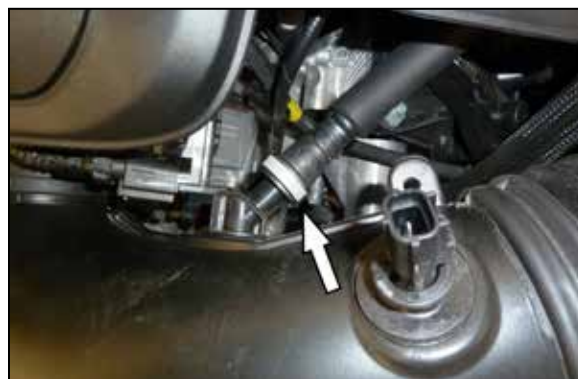
3. Depress the locking tab and then disconnect the CCV quick connect fitting.