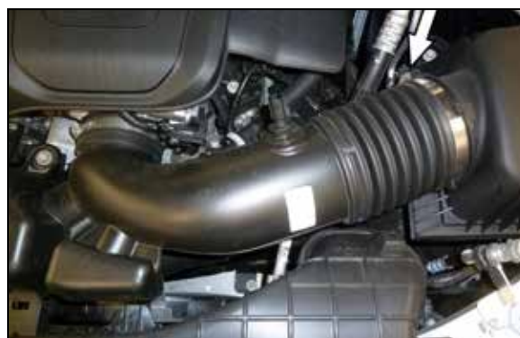
4. Loosen the hose clamp that secures the intake tube to the air filter housing.