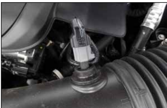
2. Disconnect the IAT sensor electrical connection.

1. Turn off the ignition and disconnect the negative battery cable. NOTE: Disconnecting the negative battery cable erases pre-programmed electronic memories. Write down all memory settings before disconnecting the negative battery cable. Some radios will require an anti-theft code to be entered after the battery is reconnected. The anti-theft code is typically supplied with your owner's manual. In the event your vehicles anti-theft code cannot be recovered, contact an authorized dealership to obtain your vehicles anti-theft code.