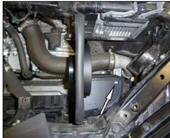
10. Install the heat shield into the vehicle and secure with the provided hardware.