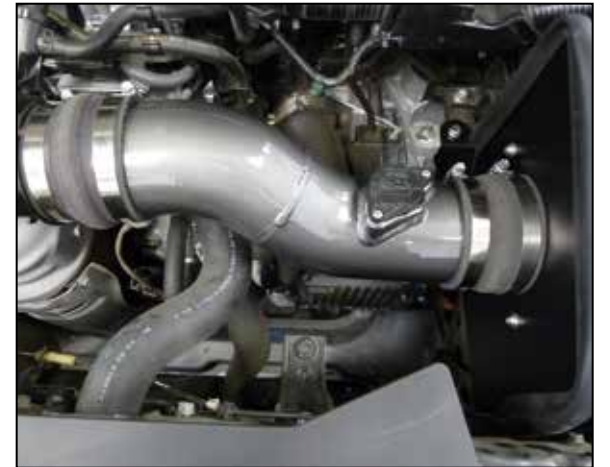
14. Install the K&N intake tube into the couplers, adjust for best fit and then secure with the provided hose clamps.