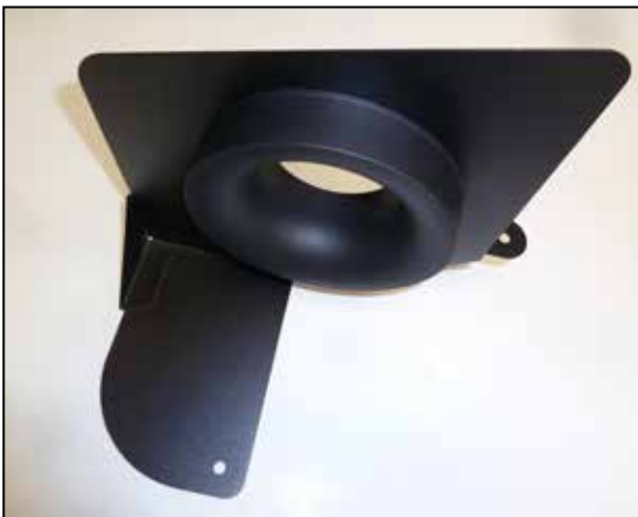
7. Install the filter adapter into the heat shield using the provided hardware.