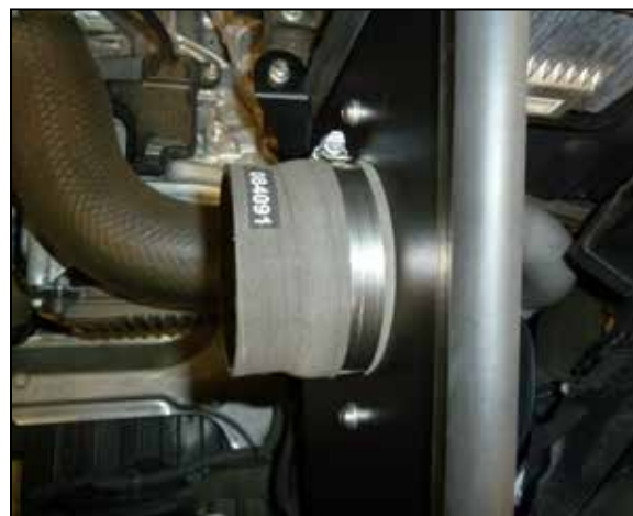
11. Install the provided step coupler onto the filter adapter and secure with the provided hose clamp.