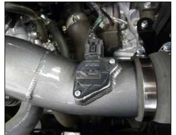
15. Reconnect the mass air sensor electrical connection.