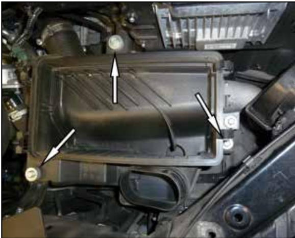
6. Loosen the three bolts that secure the lower air filter housing to the inner fender and then remove the housing from the vehicle.