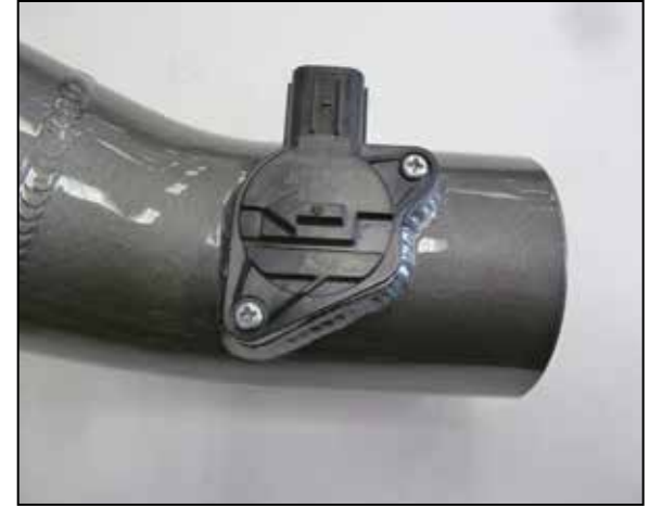
13. Remove the mass air sensor from the factory housing and install it into the K&N intake tube and secure with the factory mounting bolts.