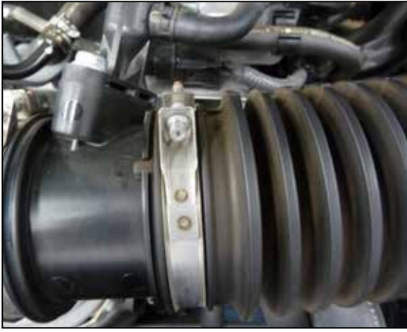
4. Loosen the clamp that secures the factory intake hose to the turbo inlet manifold.