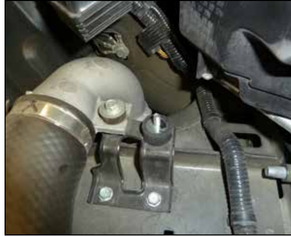
9. Install the provided rubber mounted stud onto the factory filter housing bracket as shown.