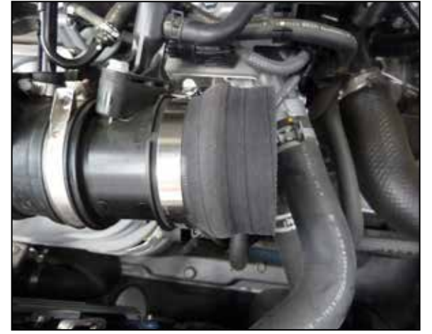
12. Install the provided hump coupler onto the turbo inlet manifold and secure with the provided hose clamp.