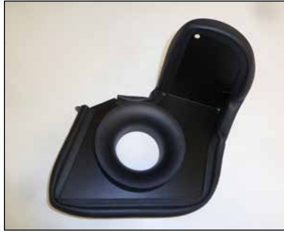
8. Install the provided edge trim onto the heat shield as shown, some trimming will be necessary.