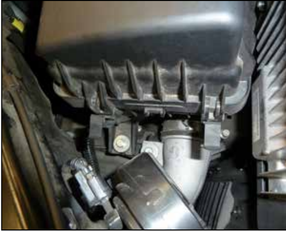
5. Release the two spring clamps that secure the air filter housing lid, remove the lid, intake hose and factory air filter.