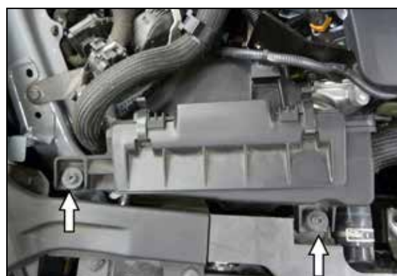
2. Remove the bolts that secure the passenger side air filter housing to the core support.