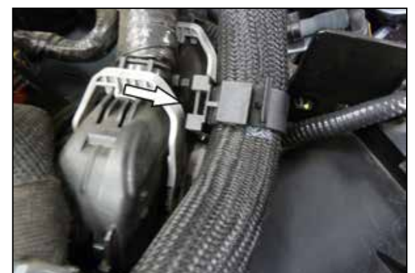
3. Release the clip holding the coolant hose and remove the clip from the bracket.