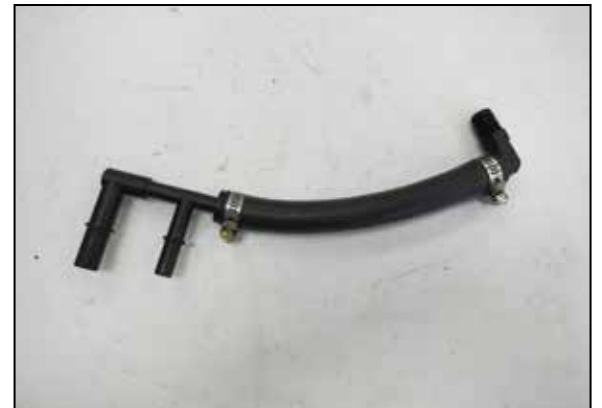
18. Assemble the provided Ejector fitting, vent hose and 90-degree npt fitting as shown.