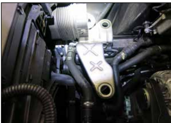
9. Remove the three bolts that secure the air filter mounting bracket and then remove the bracket from the vehicle.