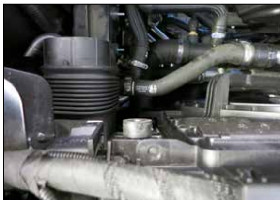
14. On Giulia models, install the provided 1/2" M/F rubber mounted stud into the core support.