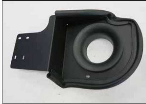
11. Install the provided edge trim onto the heat shield as shown.