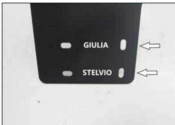
15. Install the heat shield onto the rubber mounted studs using the holes as noted in the photo.