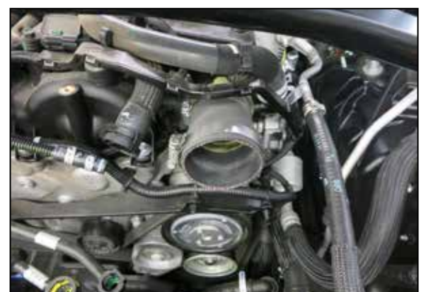
20. Install the provided step coupler onto the turbo inlet as shown and secure with the provided hose clamp.