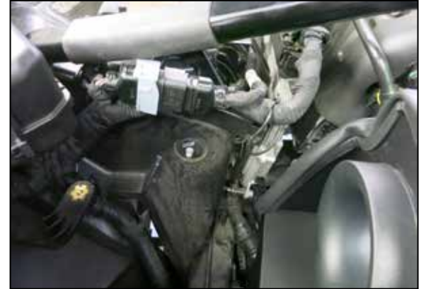
17. Adjust the wiring harness to sit on the top of the bracket to allow for air filter clearance.