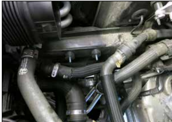
12. Install the two M/M rubber mounted stud into the frame rail as shown.