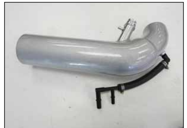
19. Install the Ejector assembly onto the K&N intake tube as shown.