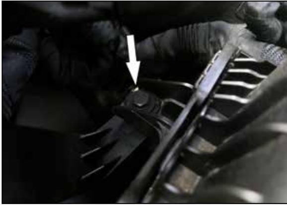
7. Remove the bolt that secures the air filter housing.