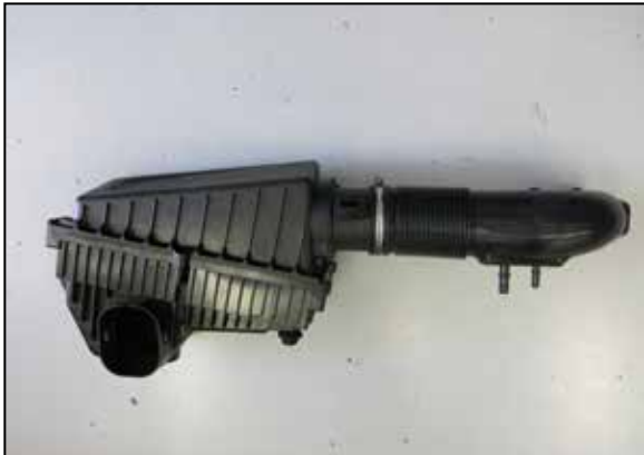
8. Remove the complete stock intake system from the vehicle.