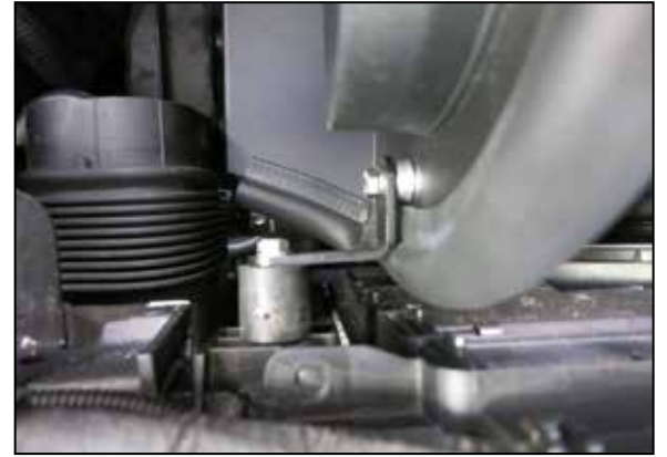
16. Using the provided hardware and spacer, secure the "L" bracket to the heat shield and rubber mounted stud.