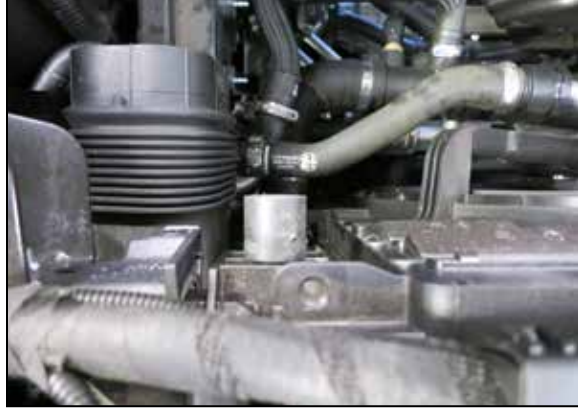
13. On Stelvio models, install the provided 1" M/F rubber mounted stud into the core support.