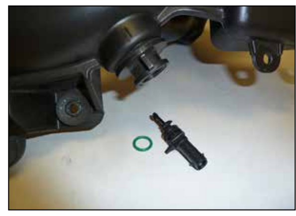
7. Remove the temp sensor from the factory intake tube by gently lifting the tab and rotating the sensor counter clockwise. Once the sensor is removed, remove the sealing O ring from the sensor.

NOTE: The temp sensor is very fragile, use care while handling.