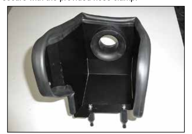
10. Install the provided edge trim onto the heat shield as shown, some trimming of the edge trim will be necessary. Install the two provided mounting studs onto the heat shield and secure with the provided hardware.