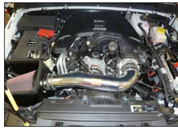
15. Reconnect the vehicle's negative battery cable. Double check to make sure everything is tight and properly positioned before starting the vehicle.

NOTE: Drycharger® air filter wrap; part # RU-2815DK is available to purchase separately. To learn more about Drycharger® filter wraps or look up color availability please visit http://www.knfilters.com®.