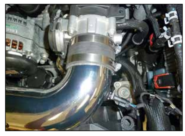
12. Install the intake tube into the coupler at the filter adapter and then into the coupler at the throttle body, adjust the tube for best fit and then secure with the provided hose clamps.