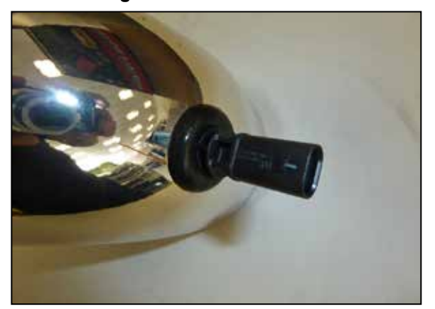
8. Install the provided grommet and factory temp sensor onto the K\&N^{\otimes} intake tube.

NOTE: The temp sensor is very fragile, use care while handling.