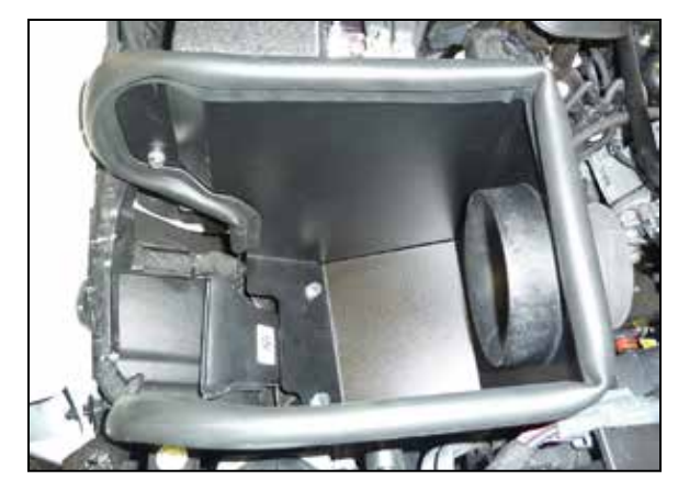
11. Install the heat shield assembly into the vehicle so that the mounting studs insert into the factory mounting grommets.