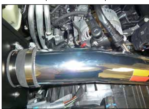
13. Connect the crank case vent line to the K\&N^{\otimes} intake tube.