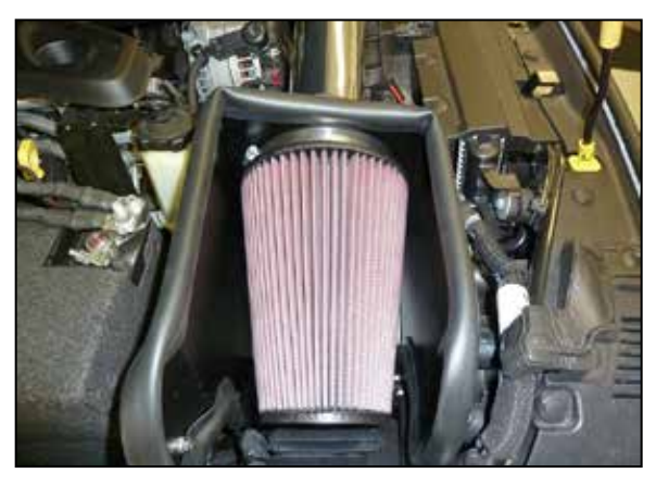
14. Install the K&N ^{\!0} air filter and secure with the provided hose clamp.

NOTE: Drycharger® air filter wrap; part # RU-2815DK is available to purchase separately. To learn more about Drycharger® filter wraps or look up color availability please visit http://www.knfilters.com®.