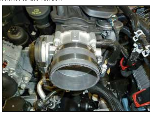
6. Install the provided coupler (08690) onto the throttle body and secure with the provided hose clamp.

5. Remove the inner bolt that attaches fender bracket to the fender.