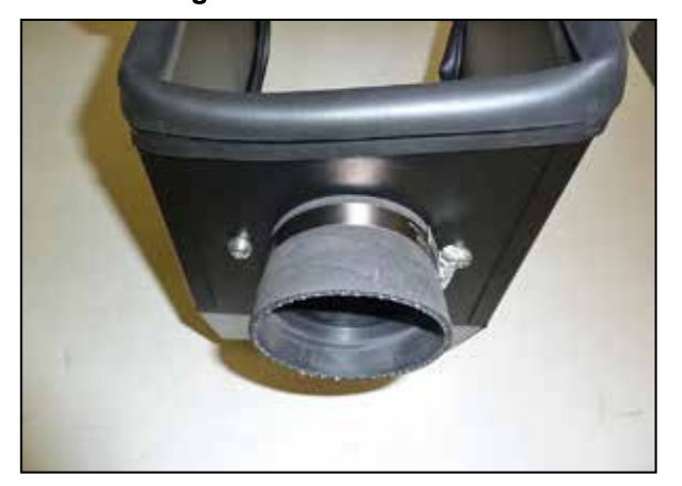
9. Install the air filter adapter onto the heat shield and secure with the provided hardware. Install the provided coupler (08186) onto the filter adapter and secure with the provided hose clamp.

NOTE: The temp sensor is very fragile, use care while handling.