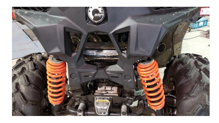
Congratulations! You are ready to begin experiencing the improved performance and driving excitement of your MBRP Ltd. Exhaust upgrade. We know you will enjoy your purchase.

In order to maintain optimal performance, the spark arrestor screen should be cleaned after the first 3 hours of use. Afterwards, clean every 30-35 hours of use. The spark arrestor can be accessed by removing the four (4) screws and outlet tip. Retighten the screws to 60in-lbs (6.8Nm) when reassembling. Refer to Figure 4.