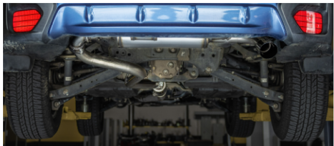
Step 4. Once proper positioning has been attained for the new exhaust system, tighten the clamp and fasteners using the torque specification on page one of these instructions. Inspect all clamps and flasteners after 25-50 miles of operation. Re-tighten if necessary.

MAGNAFLOW: 1901 Corporate Centre Dr - Oceanside, CA 92056 | 1(800)990-0905 Technical Support: 1(800) 959-9226 | Email: moreinfo@magnaflow.com