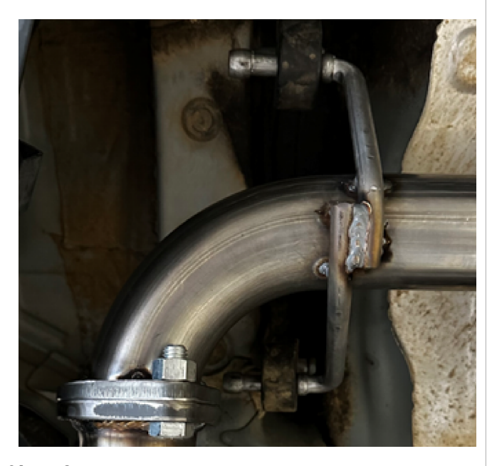
Step 2. Install the MagnaFlow muffler assembly into the empty space near the rear bumper. For easiest installation, begin with the rear driver's side insulator.