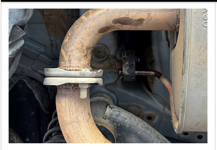
Step 1 . Begin removal of your OEM Muffler Assembly by unbolting the flange fasteners and disconnecting the rubber insulators that suspend the Assembly (see above). The Muffler Assembly can now be removed. Do not damage or discard the rubber insulators as they will be used to Install the new system